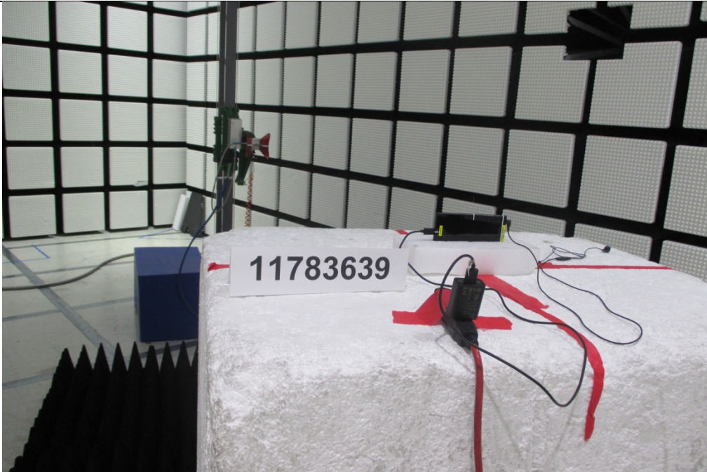
RADIATED BACK PHOTO (ABOVE 1 GHz)