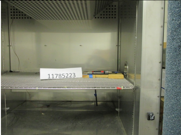
FREQUENCY TOLERANCE OVER EXTREME CONDITIONS