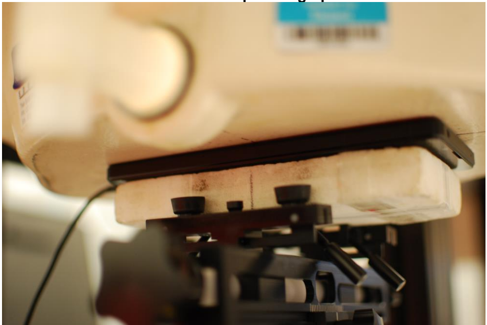
Test Setup Photo 2 – Back Side at 0 mm