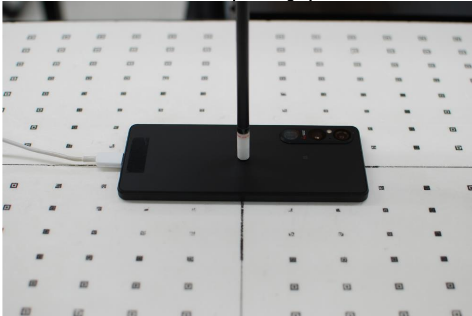
Test Setup Photo 3 – Back Side at 2 mm