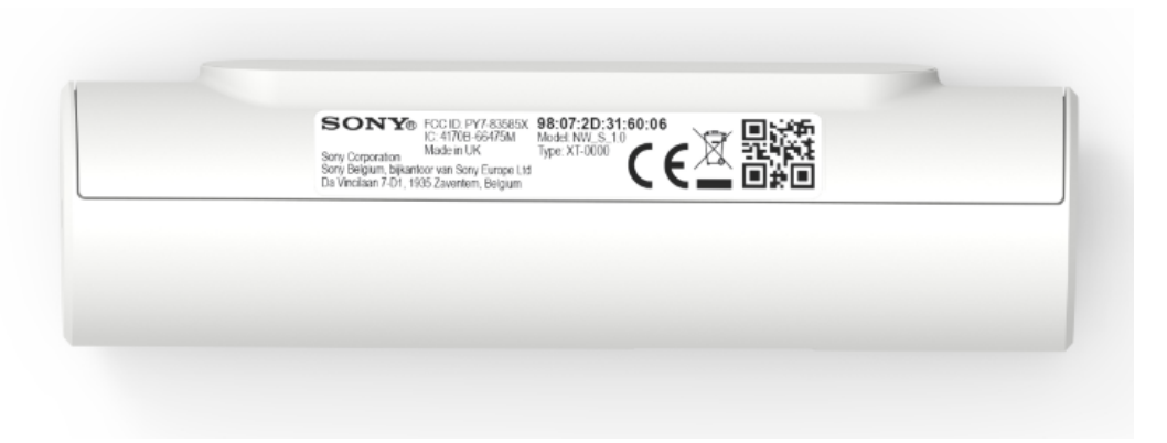
Fig.2 Location view