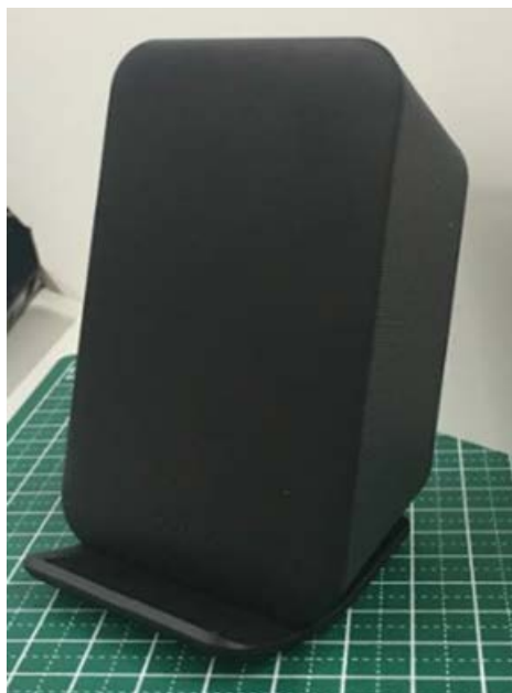
(Side view with Stand Accessory)