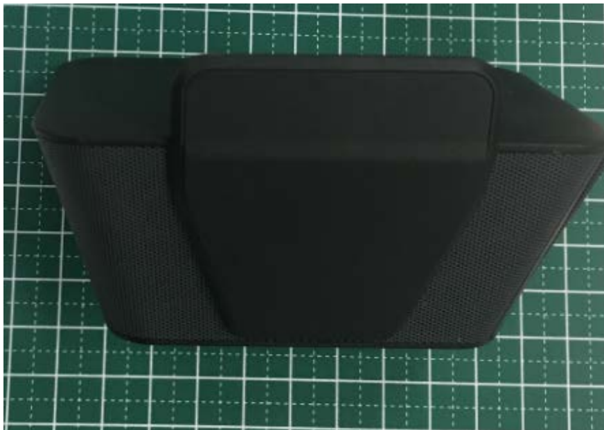
(Bottom Side with Stand Accessory)