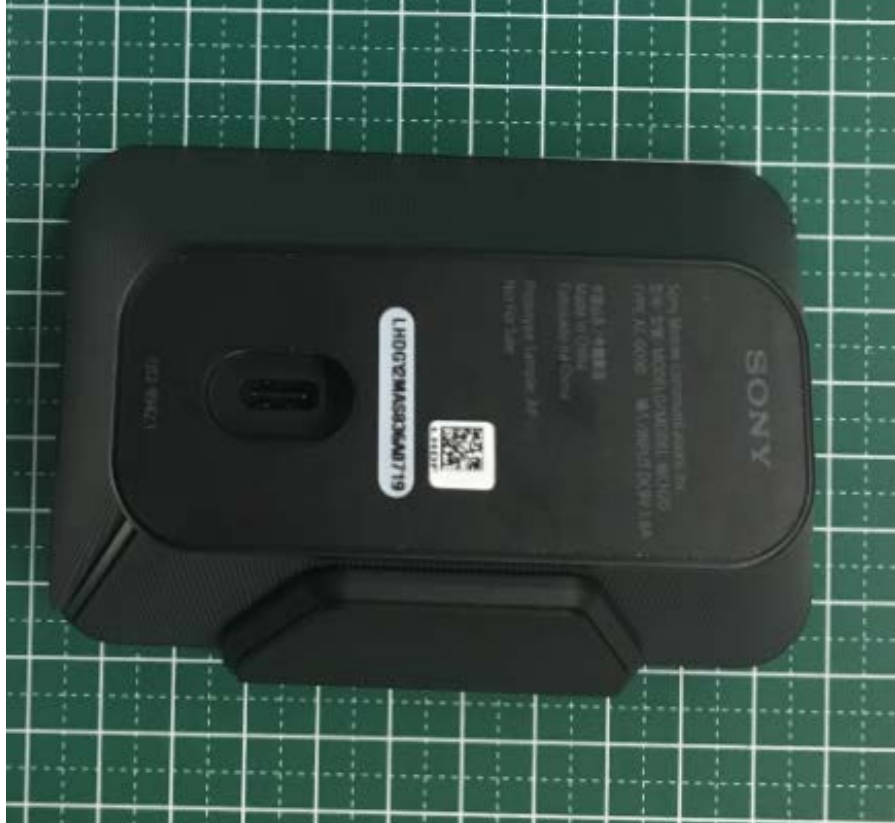
(Back Side with Stand Accessory)