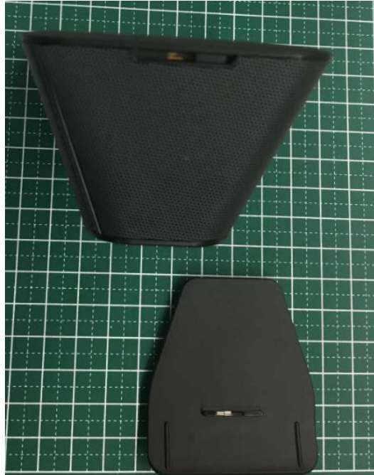
(Bottom Side without Stand Accessory)