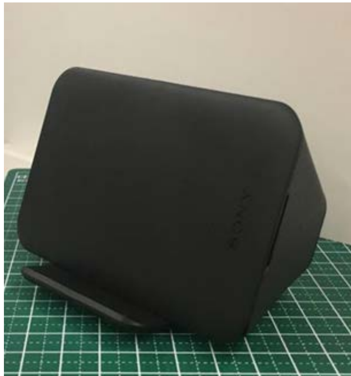
(Side view with Stand Accessory)