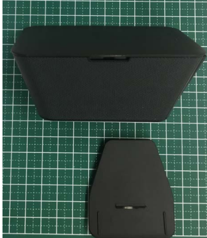
(Bottom Side without Stand Accessory)