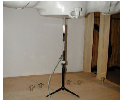
Figure A-2 System Verification Setup Photo