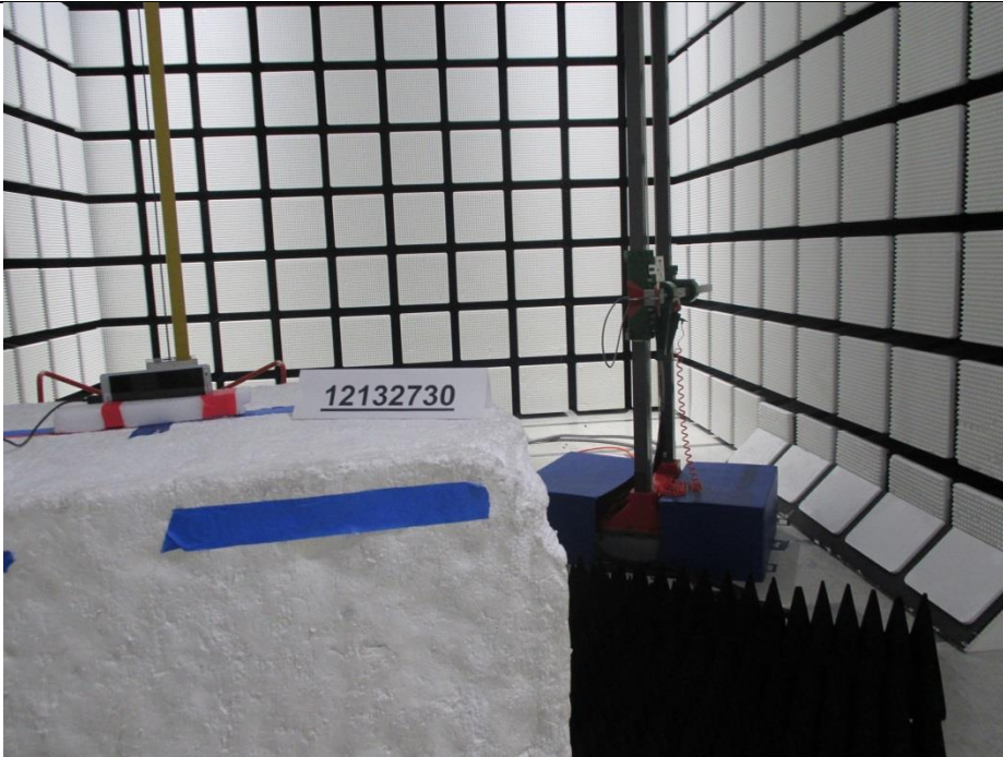
RADIATED BACK PHOTO (ABOVE 1 GHz)