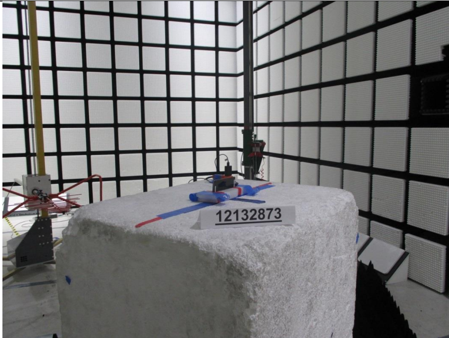
RADIATED BACK PHOTO (ABOVE 1 GHz)