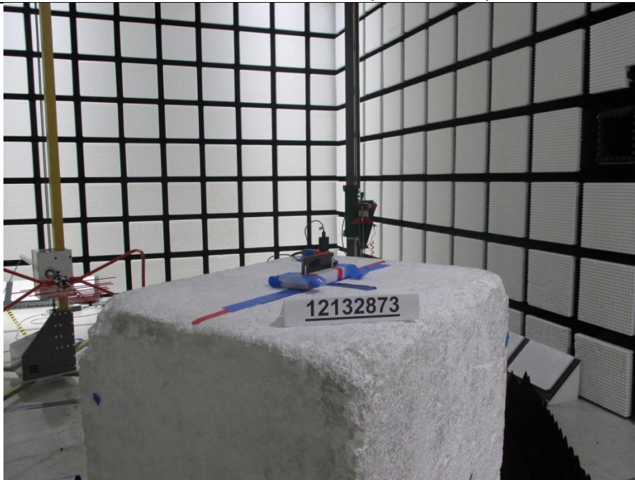
RADIATED BACK PHOTO (ABOVE 1 GHz)