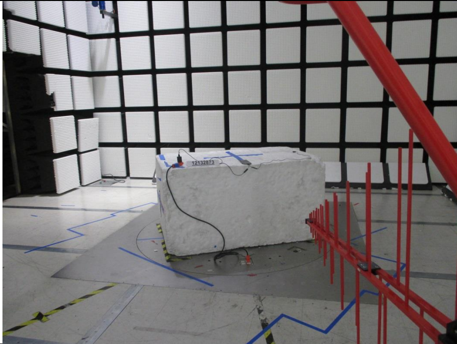
RADIATED FRONT PHOTO (BELOW 1 GHz)