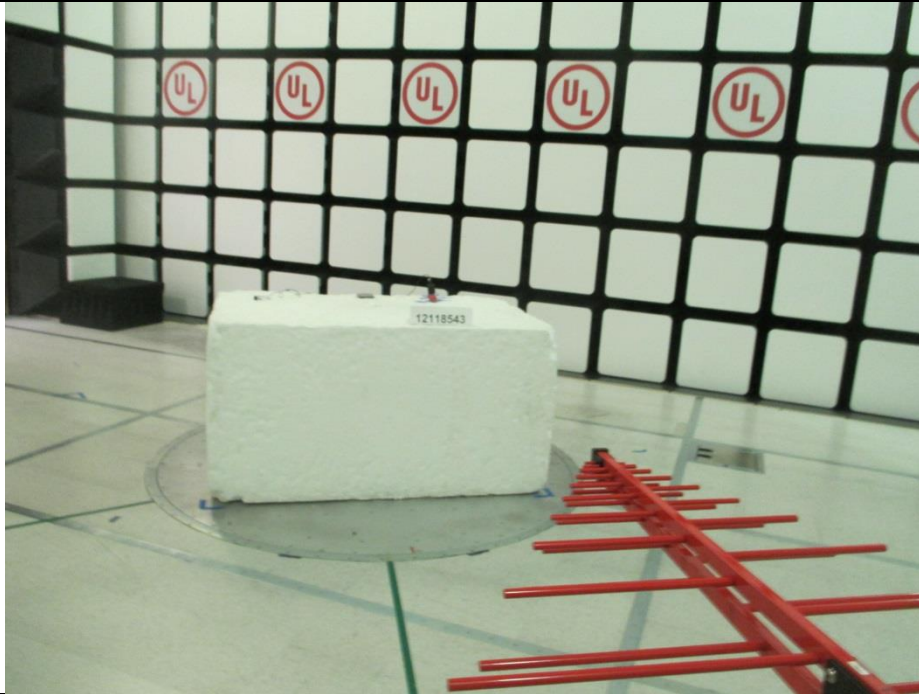
RADIATED FRONT PHOTO (BELOW 1 GHz)