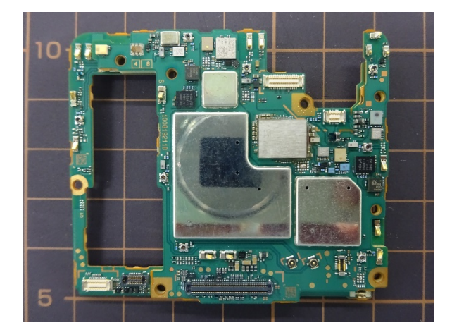
Internal Main-PWB of Rear (Rear-side)