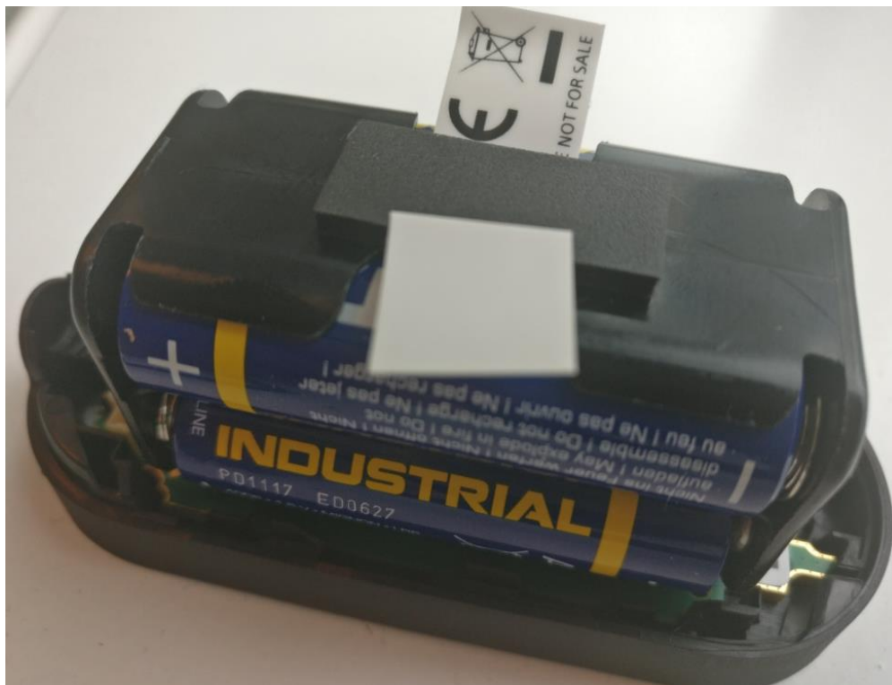
Fig.1 Inside view