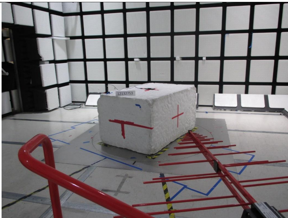
RADIATED FRONT PHOTO (BELOW 30 MHz)