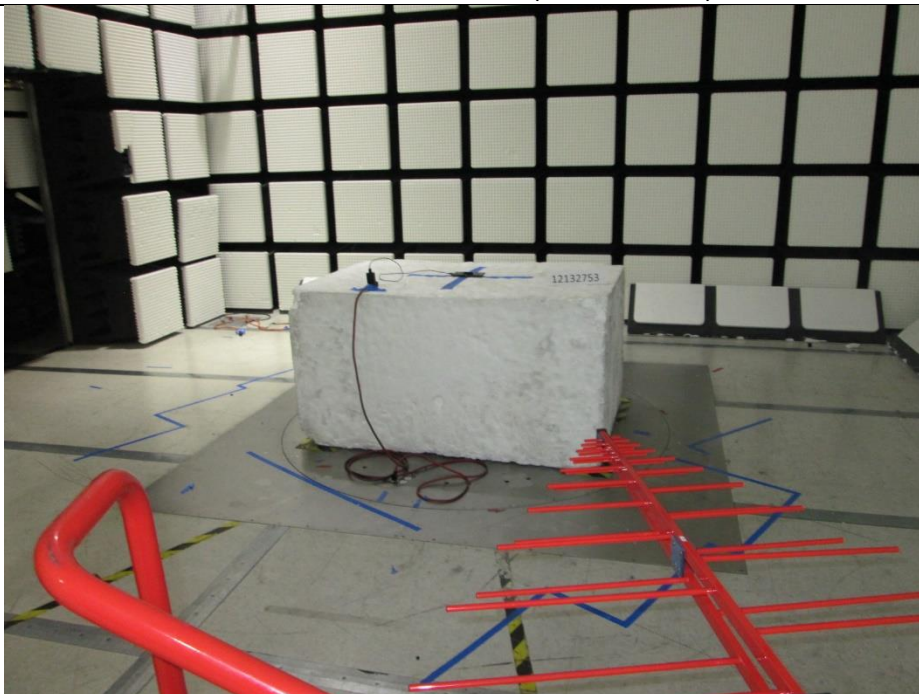
RADIATED BACK PHOTO (BELOW 1 GHz)