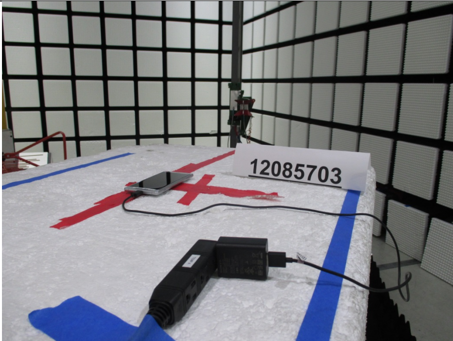
RADIATED BACK PHOTO (ABOVE 1 GHz)