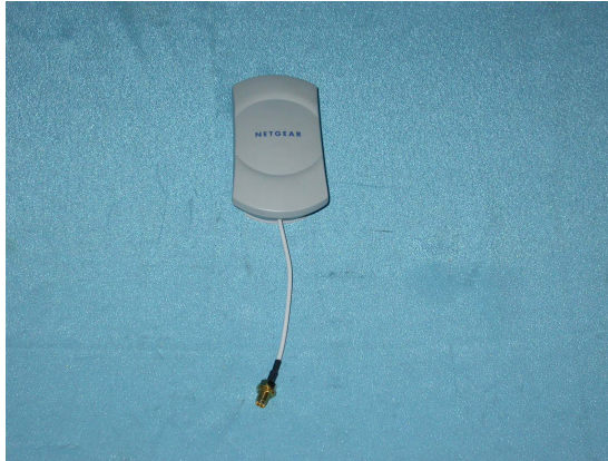
Model:ANT24O5 2.4GHz Ceiling 5dBi Antenna