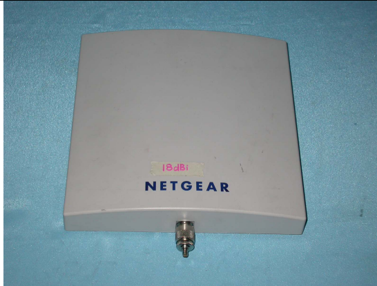
Model:ANT24D18 2.4GHz Patch 18dBi Antenna