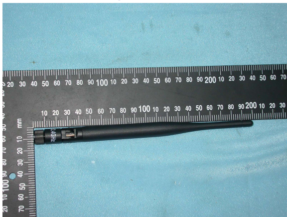
Model:SNW0007A 2.4GHz 1/2λ Dipole 5dBi