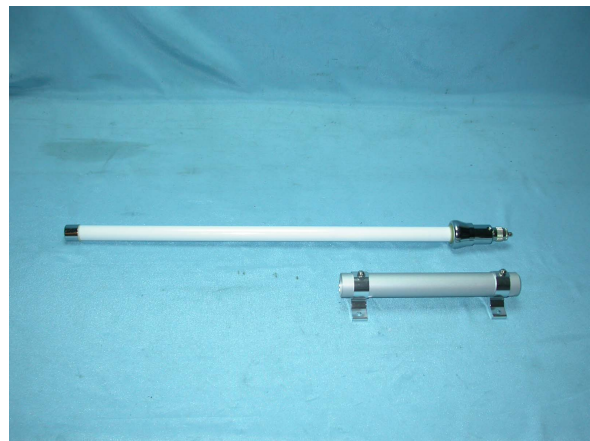
Model:ANT24P9 2.4GHz GP Omni-directional 9dBi