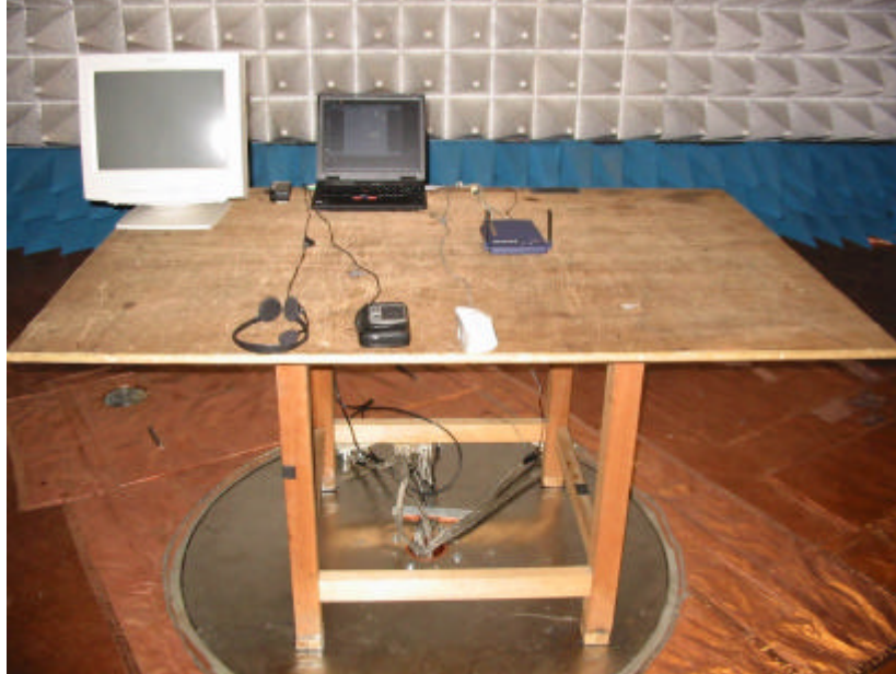
Front View of the Test Configuration