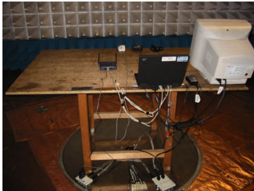
Rear View of the Test Configuration

The test configuration for frequency between 1GHz to 18GHz is same as above.