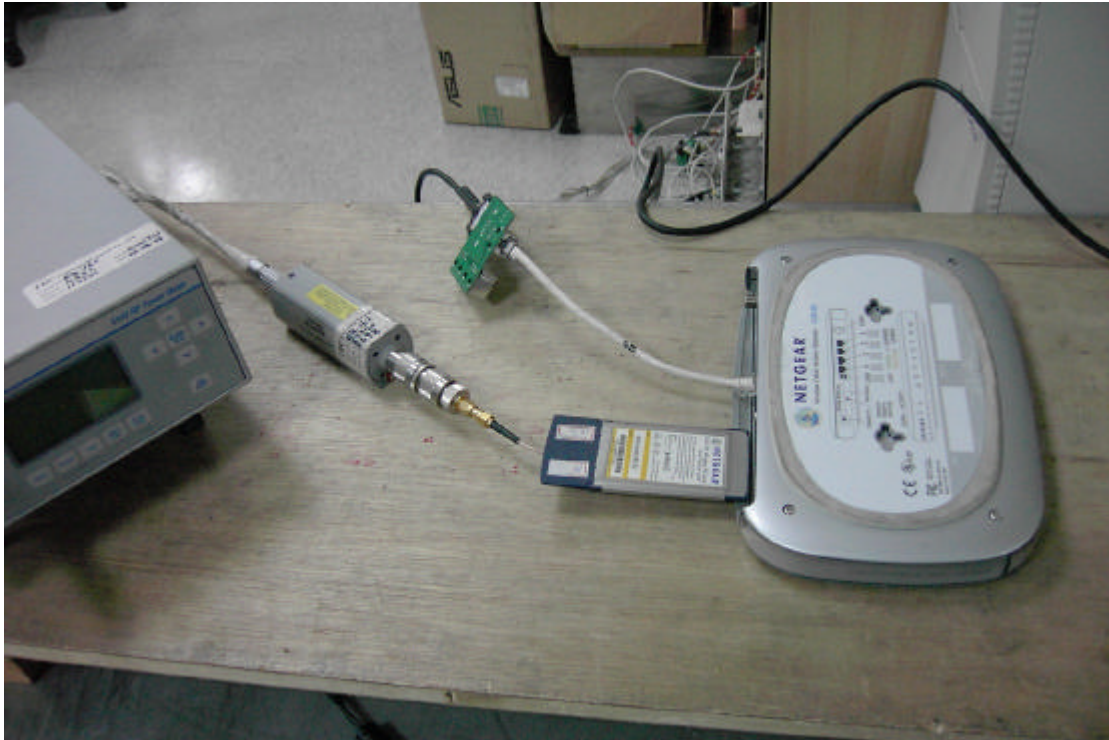
Before installation of PCMCIA card (EUT)