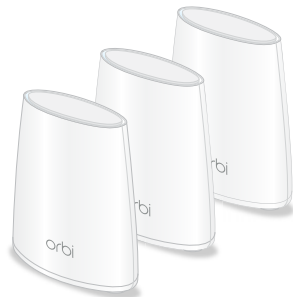
Orbi Satellite (3) (Model RBS20)