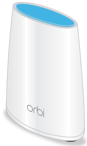
Orbi Router (Model RBR20)