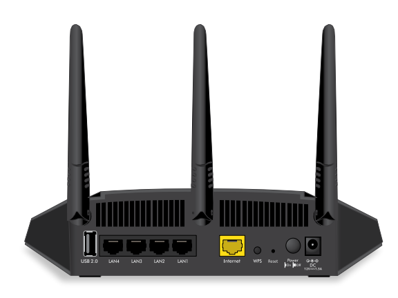
For the best WiFi performance, position the antennas as shown.