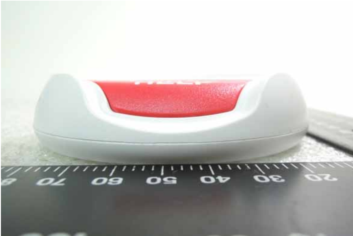
Side View of EUT – 2