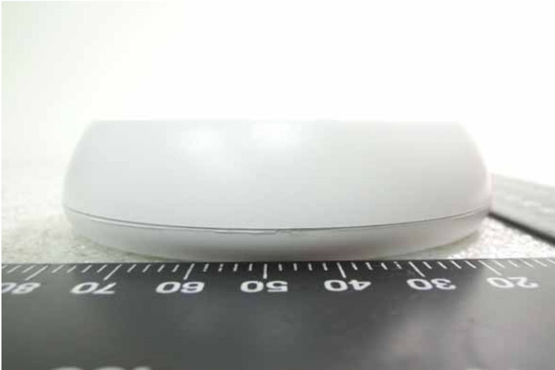
Side View of EUT – 4