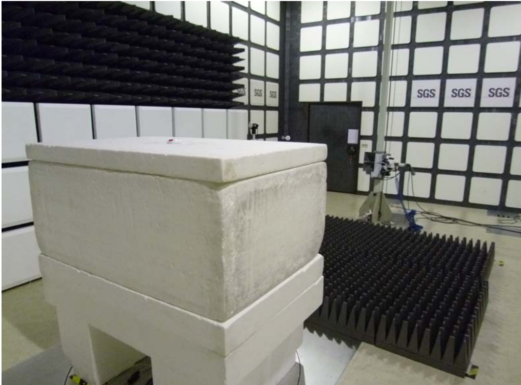
Front View of test setup