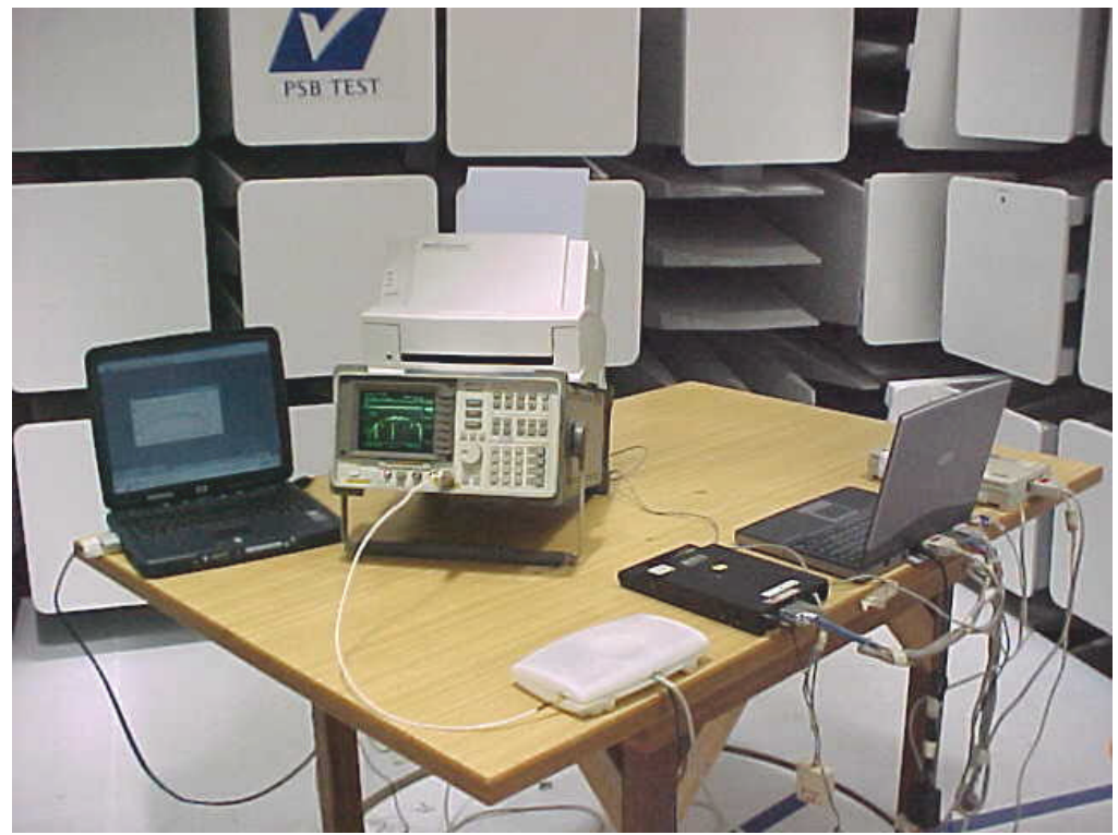
Test Setup of