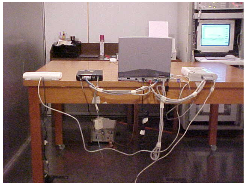
Conducted Emissions - Rear View