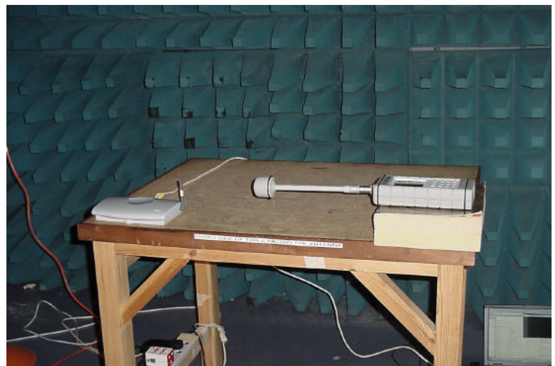
Maximum Permissible Exposure Measurements - General View