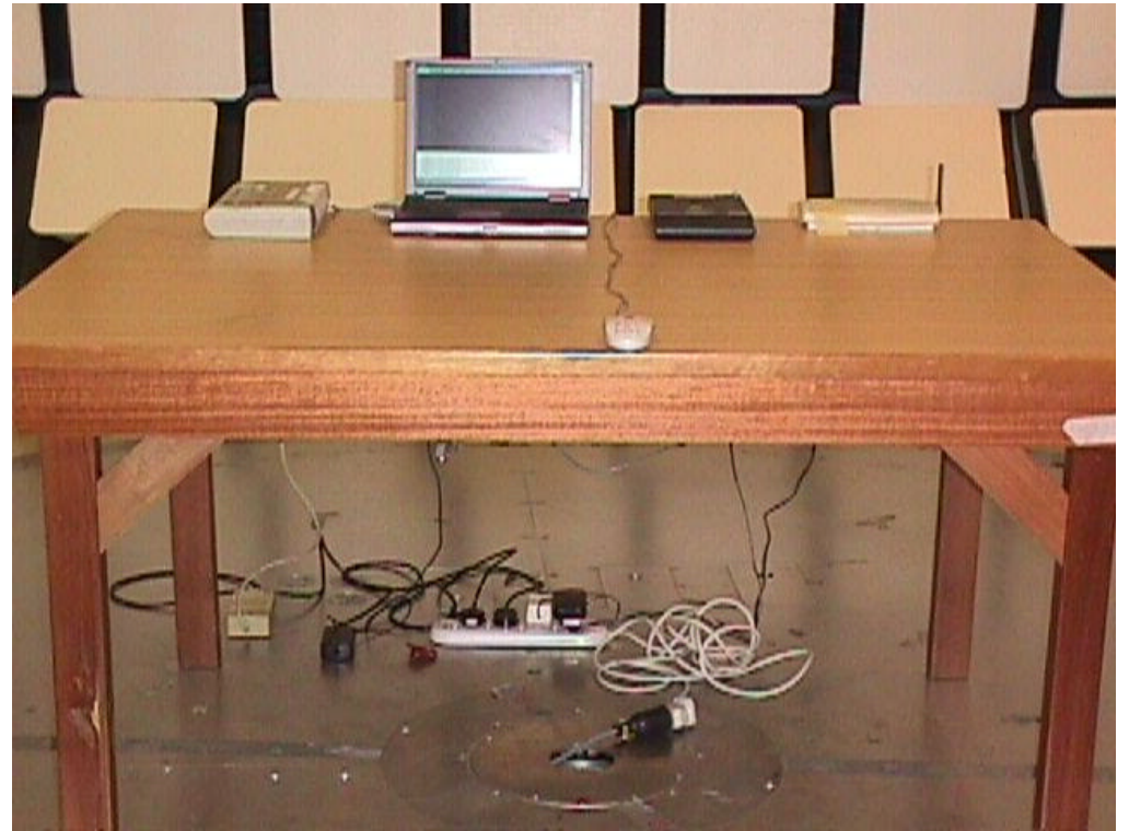
Radiated Emissions - Front View