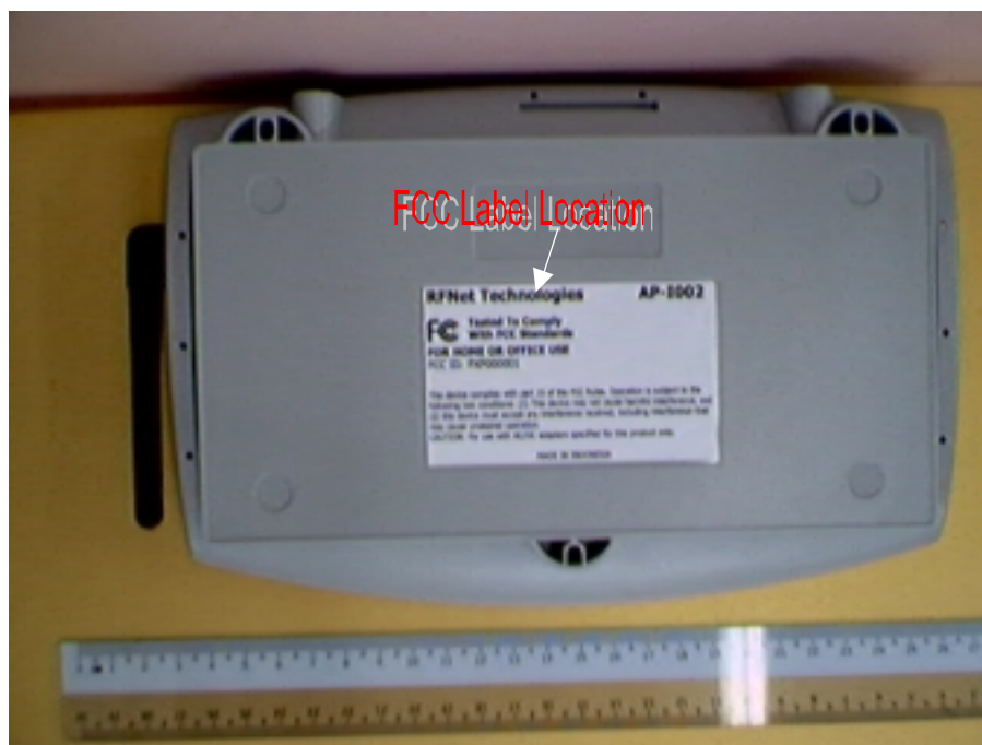
Physical Location Of Label On EUT