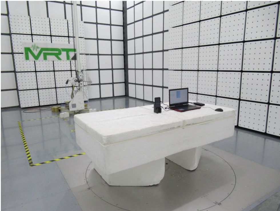
Description: Radiated Emission Test Setup for 1GHz~18GHz