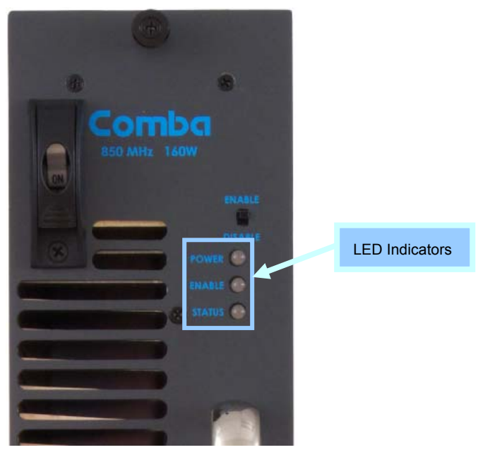
Figure 1: Controls and Indicators on Front Panel of MCPA Module

On the Front panel of MCPA Module, the controls and LED indicators are showed in following figure. The function is explained in table 1.