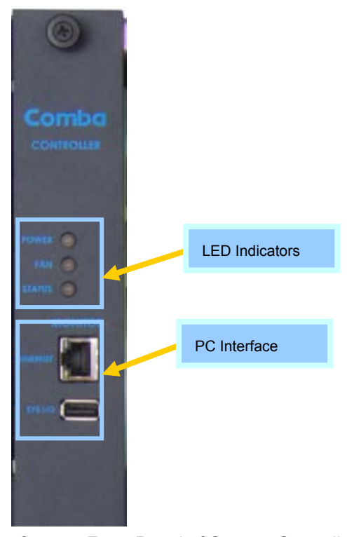
Figure 2: Indicators and Interface on Front Panel of System Controller

Except the status of MCPA can be visually monitored and controlled, the front panel of System Controller also have LED indicators and interfaces for system diagnosis and commissioning. The front panel is shown as following. The function and purpose are explained in table 3-x.