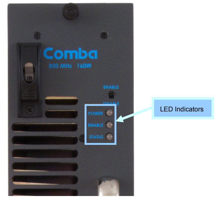
Figure 1: Controls and Indicators on Front Panel of MCPA Module

On the Front panel of MCPA Module, the controls and LED indicators are showed in following figure. The function is explained in table 1.