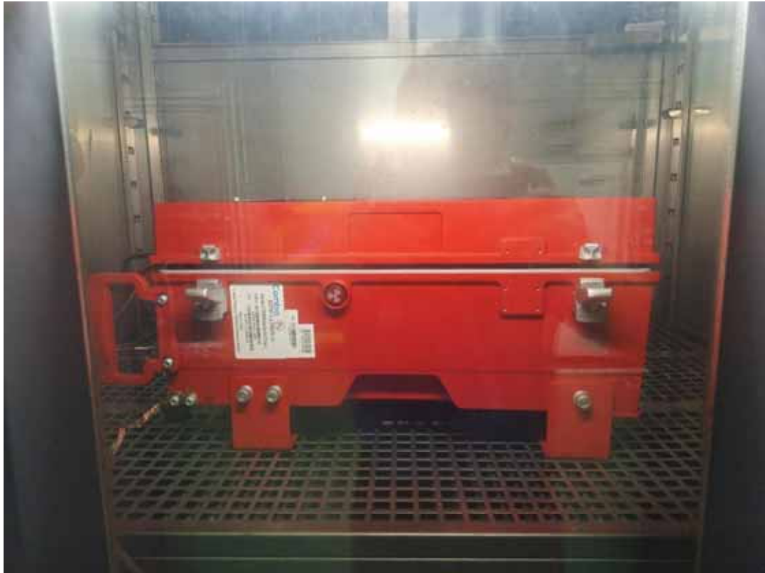
Temperature change test-2