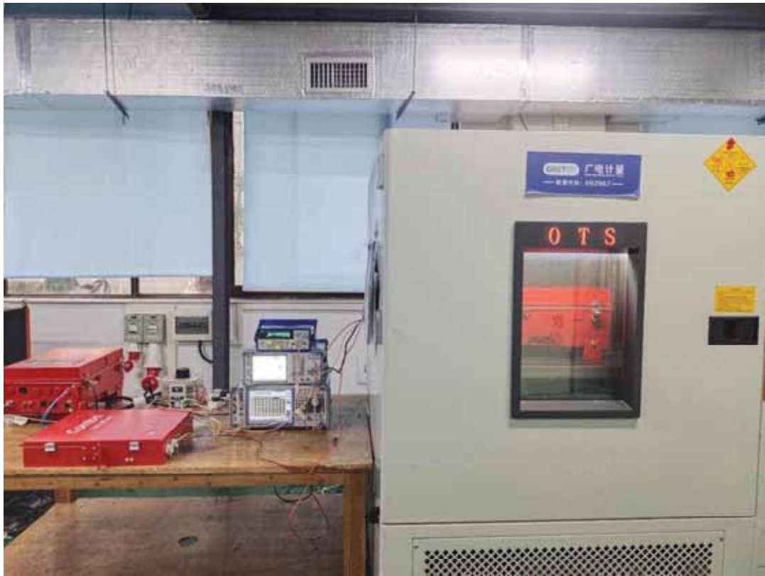
Temperature change test-1