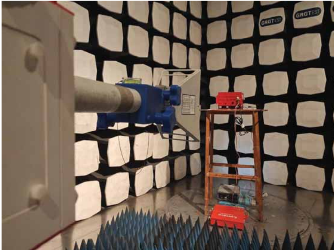
Radiated spurious emissions—Above 1GHz