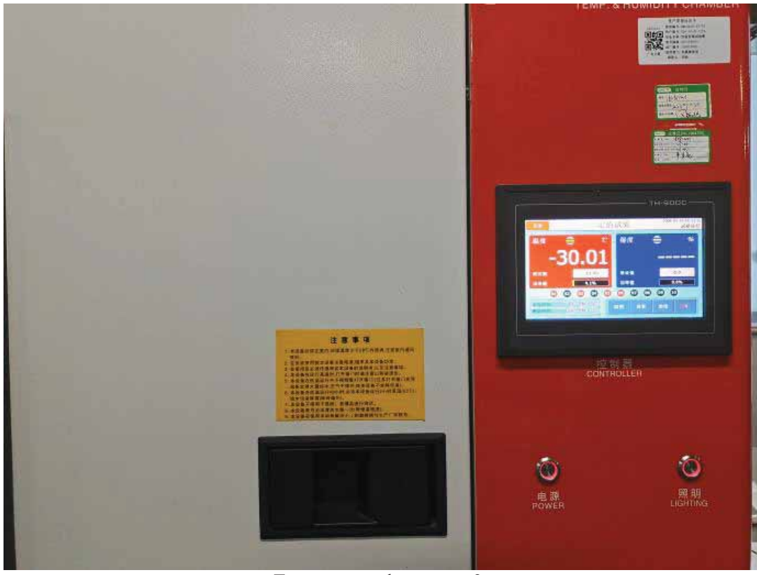
Temperature change test-3