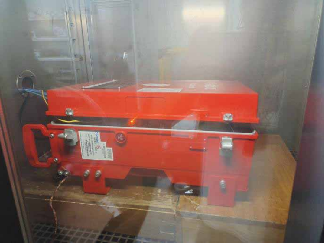
Temperature change test-2