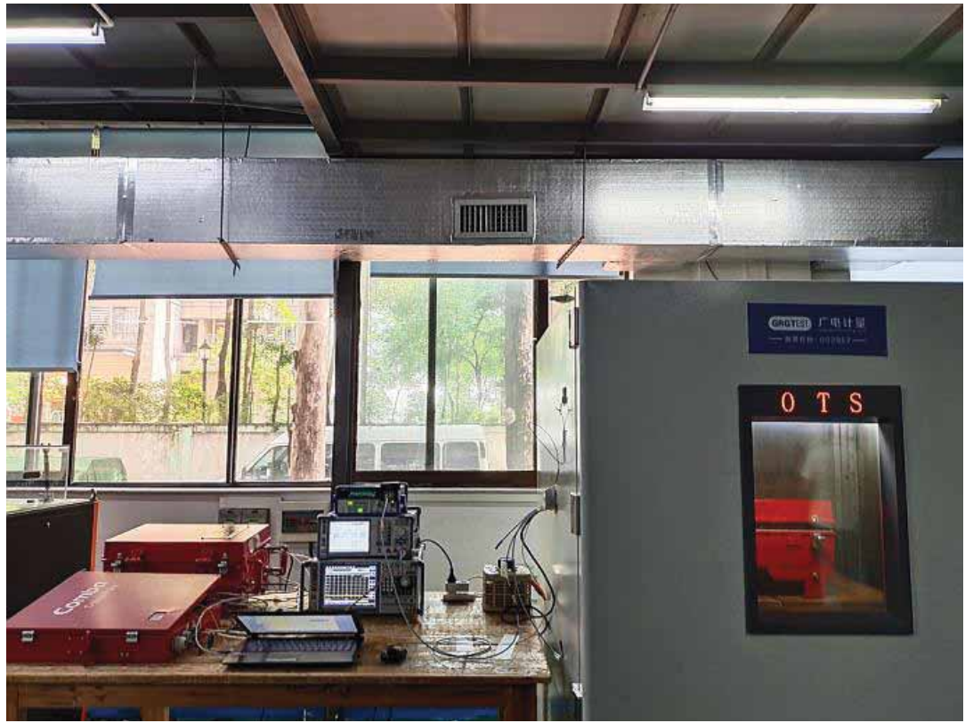
Temperature change test-1