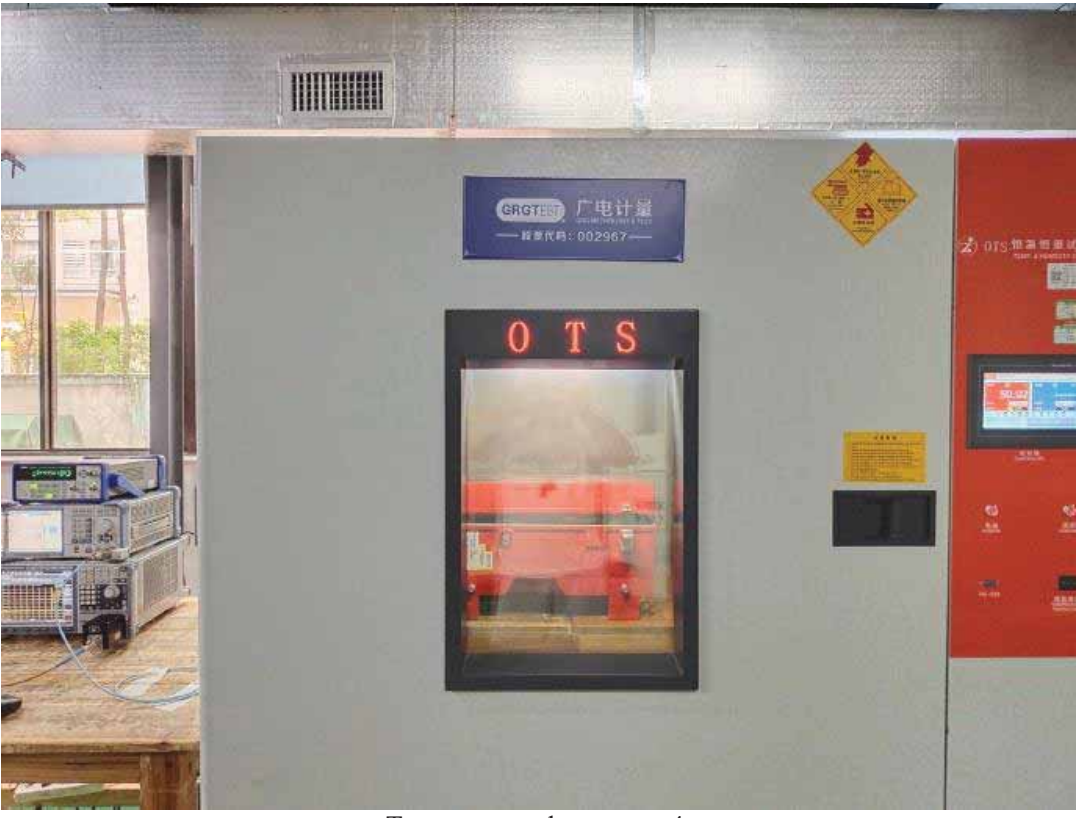
Temperature change test-4