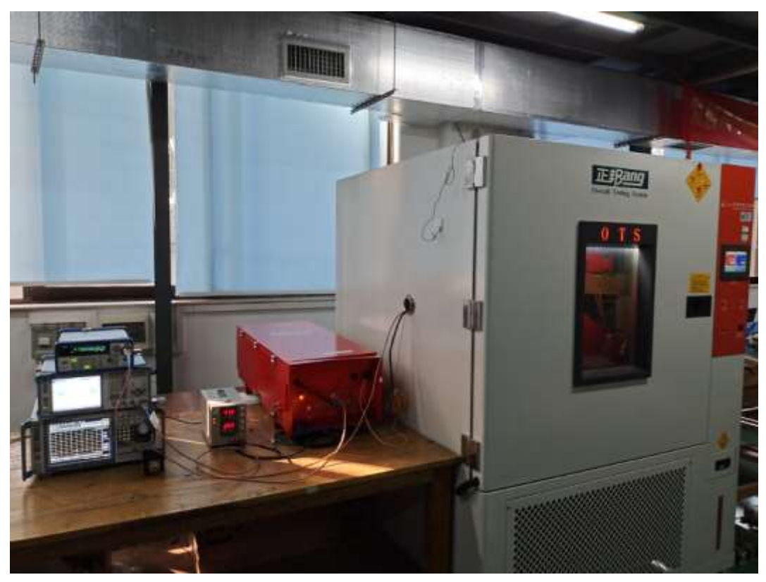
Temperature change test-3