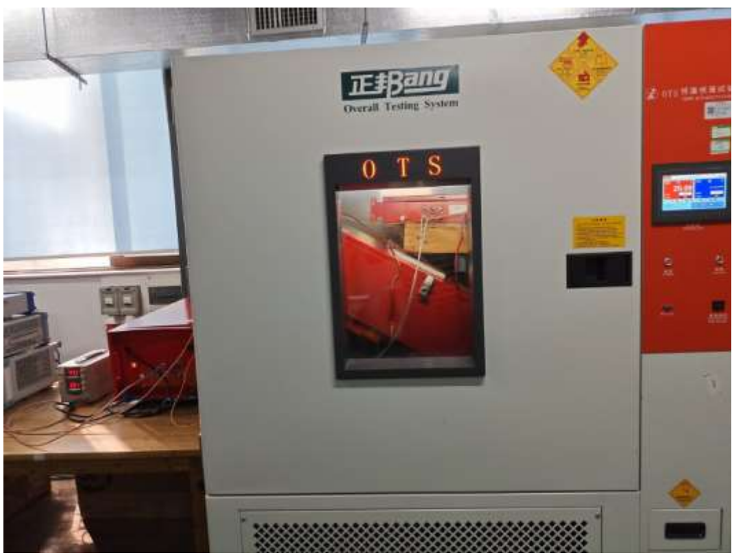
Temperature change test-4