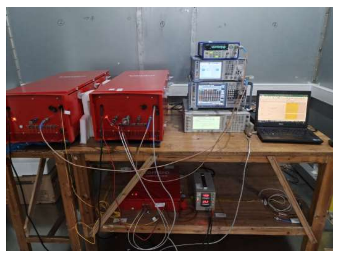
Normal temperature test scenario