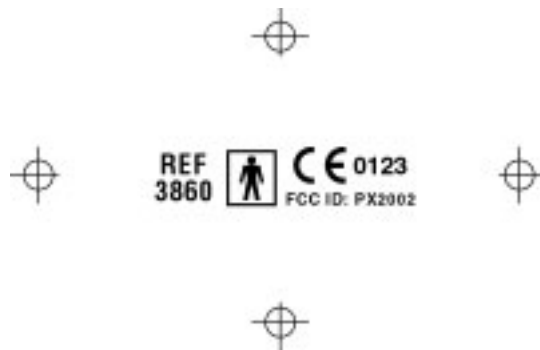
DETAIL 1 – PANTONE BLACK (37-0434-01)