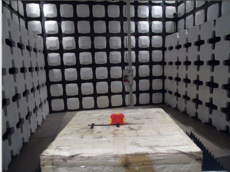
Frequency Range < Above 1GHz >