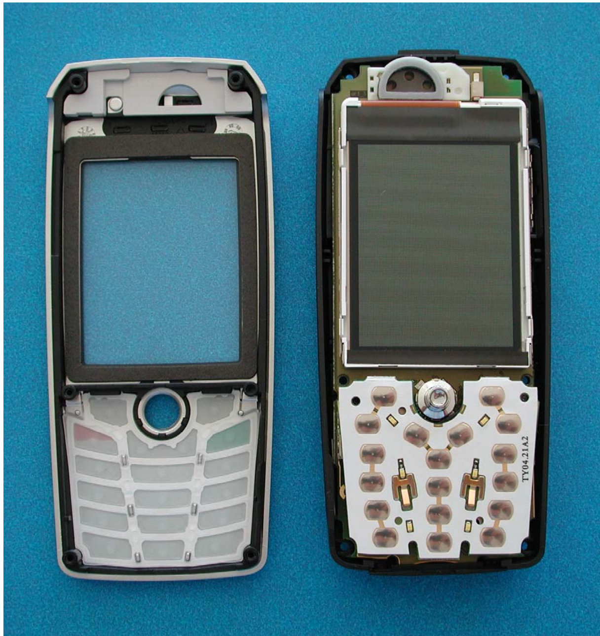
S66 Disassembly Step 2