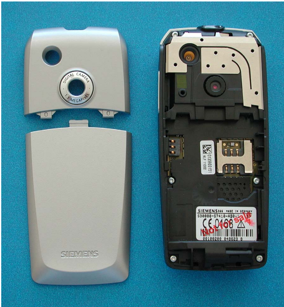
S66 Disassembly Step 1