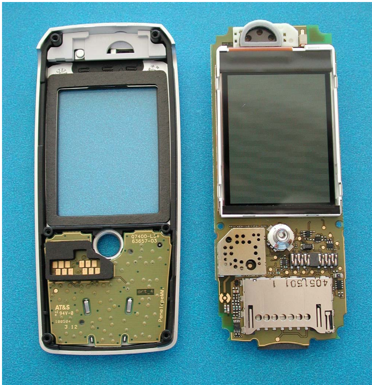
S66 Disassembly Step 3