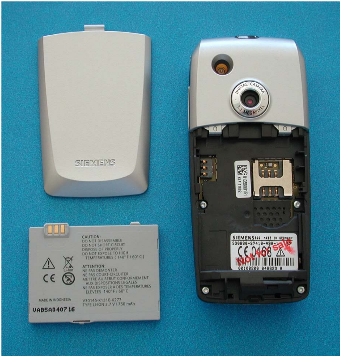
S66 Open Battery Cover (Final label: See extra exhibit)