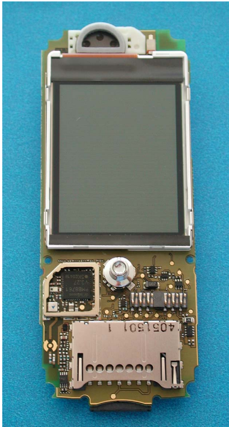
S66 PCB Front View Shields Removed