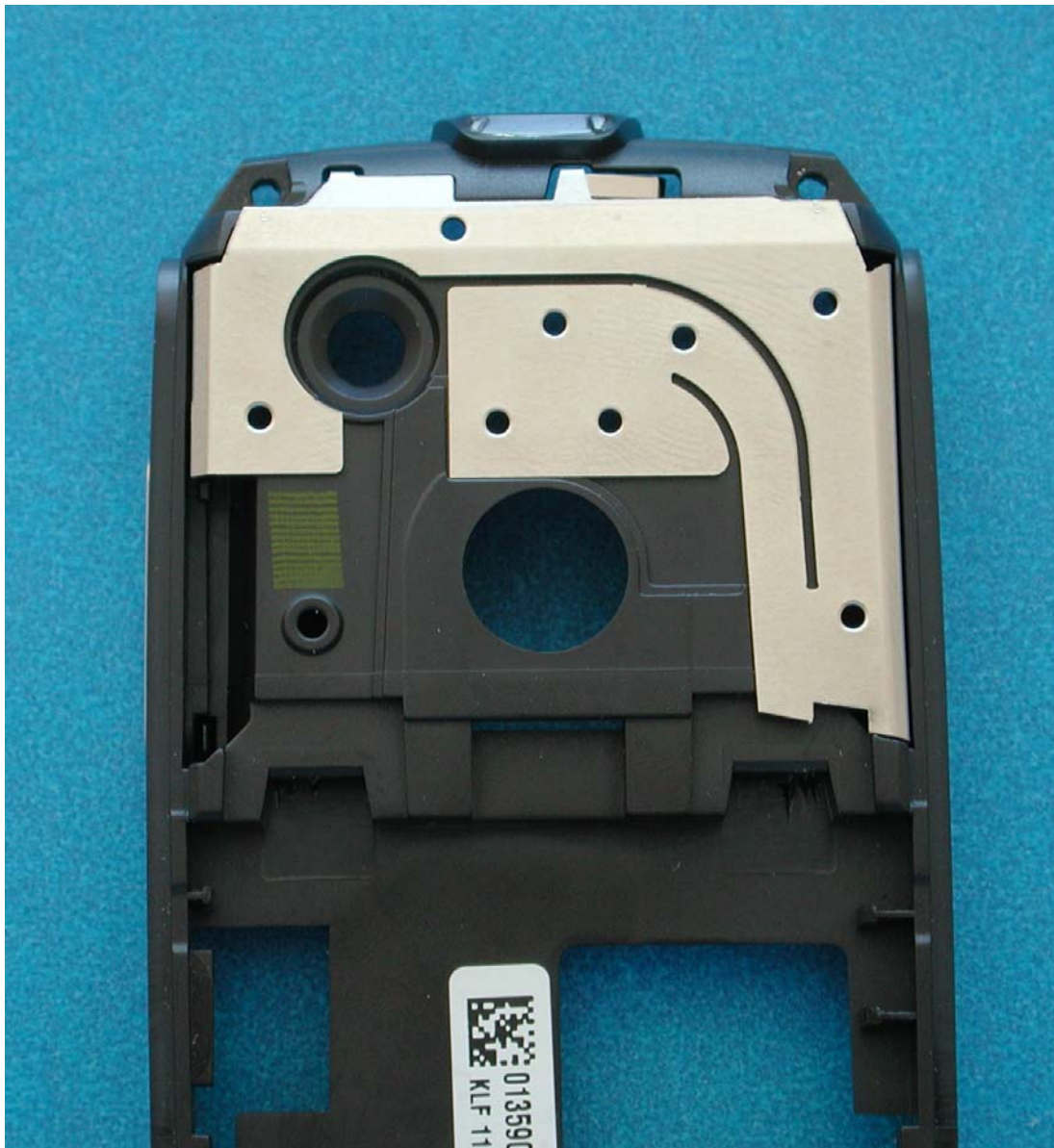
S66 Tri-Band Antenna