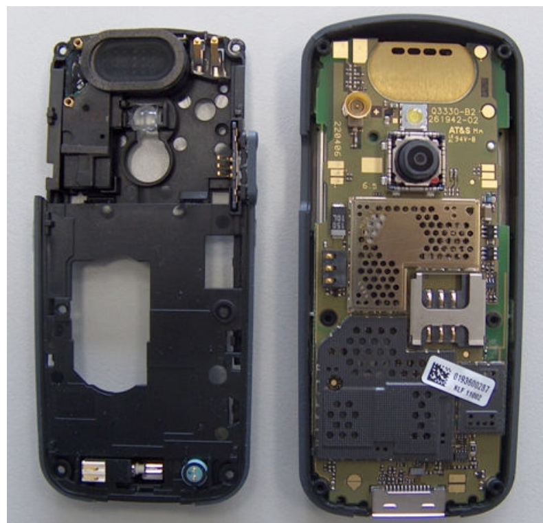
Disassemble Step 1: Lower Case opened