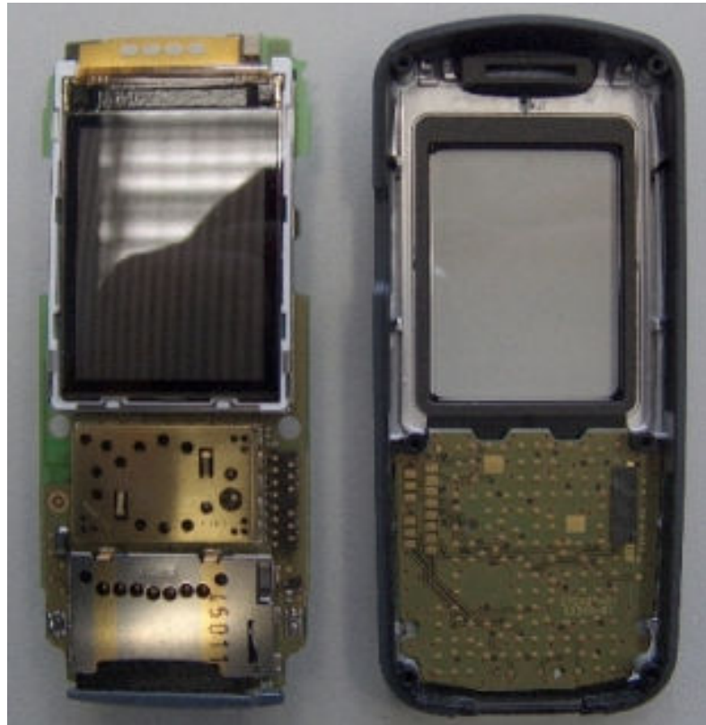
Disassemble Step 2: PCB separated from front cover