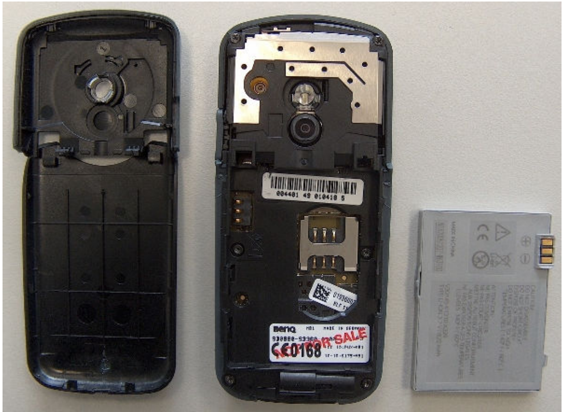
M81 Battery Lid opened