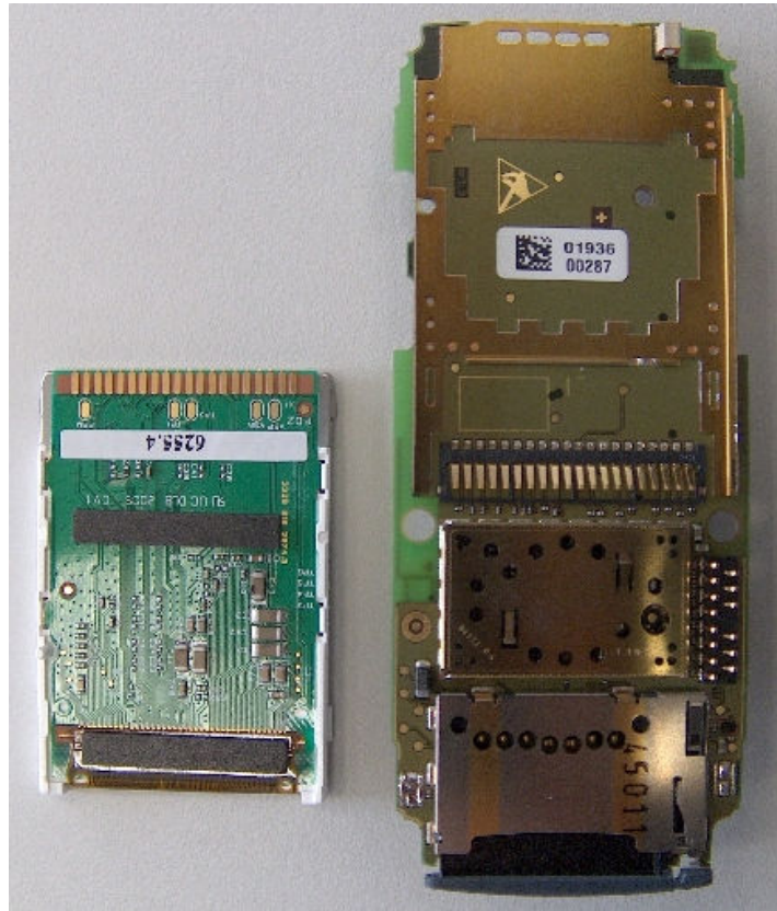
Disassemble Step 4: Display separated from PCB