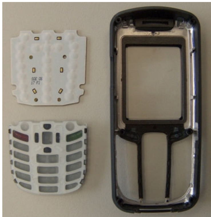
Disassemble Step 3: Front Cover disassembled