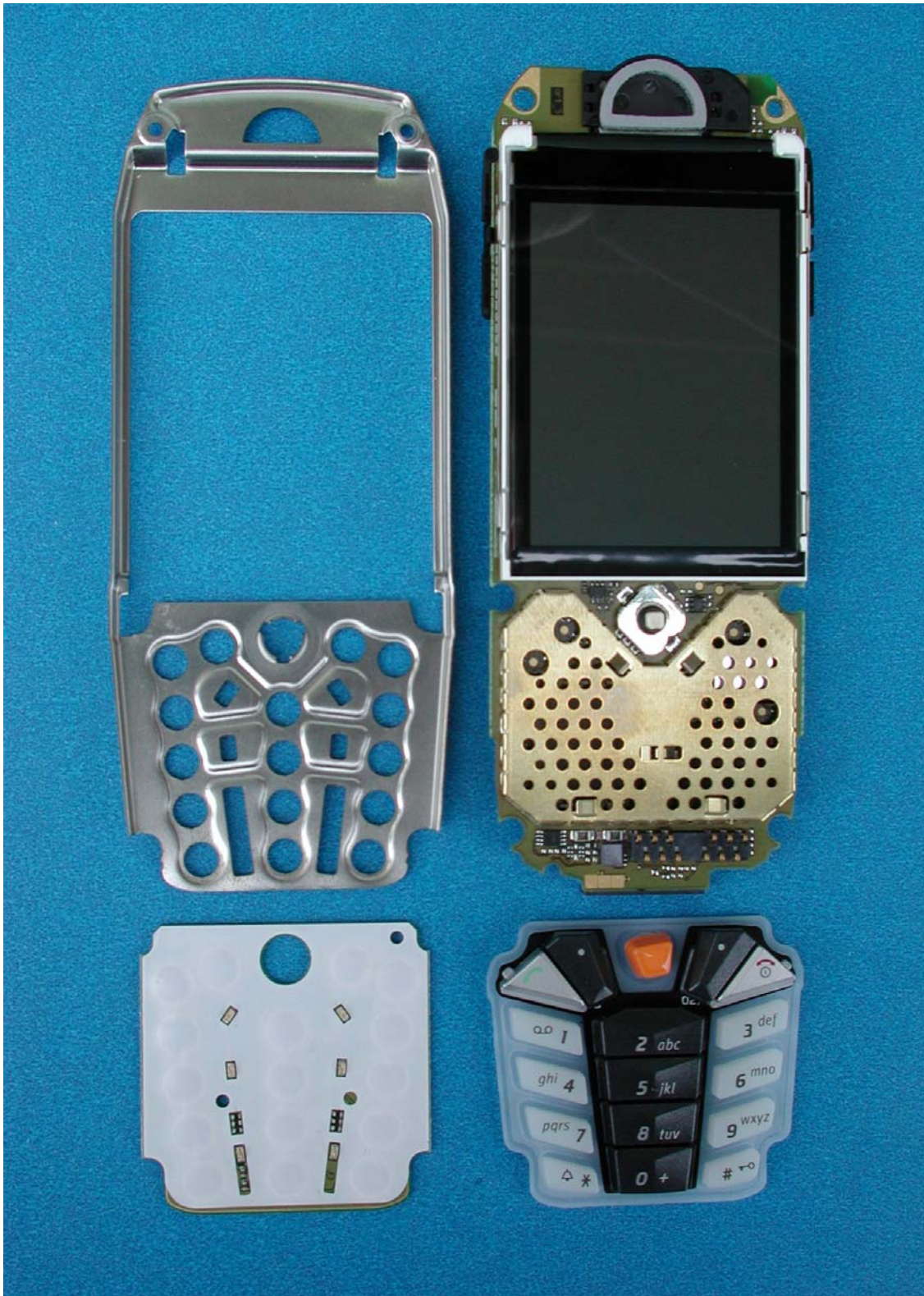
M65 Disassembly step 3