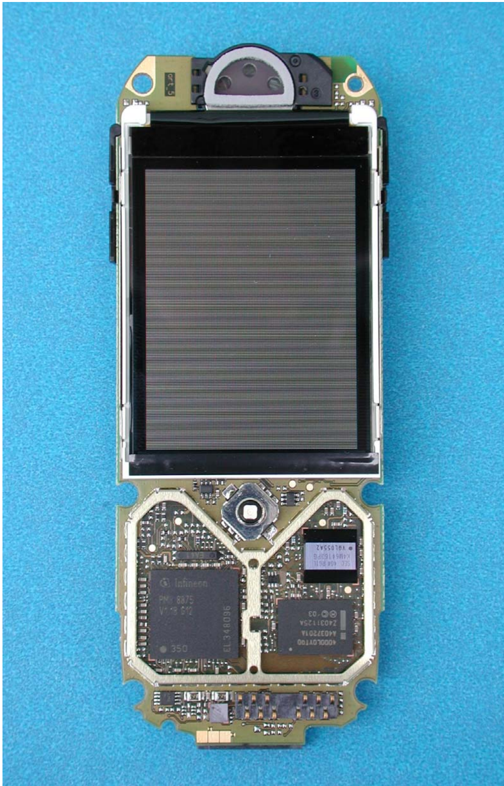
M65 Board without shield (front)