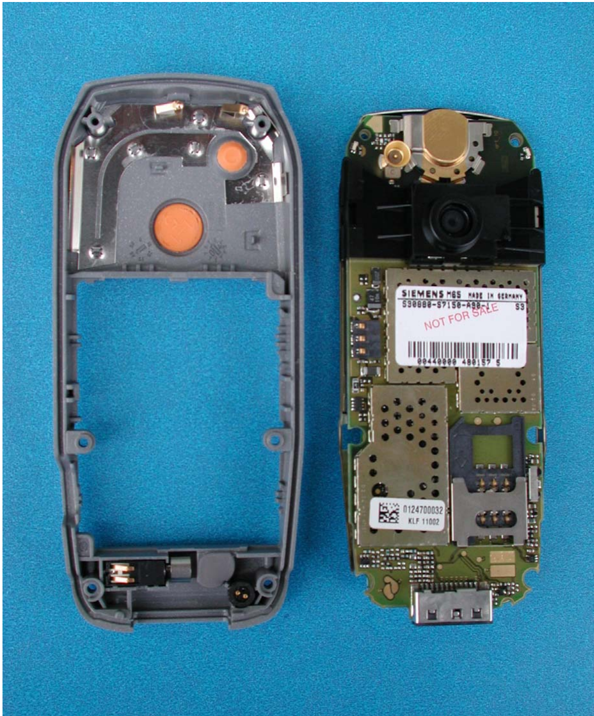
M65 Disassembly step 2