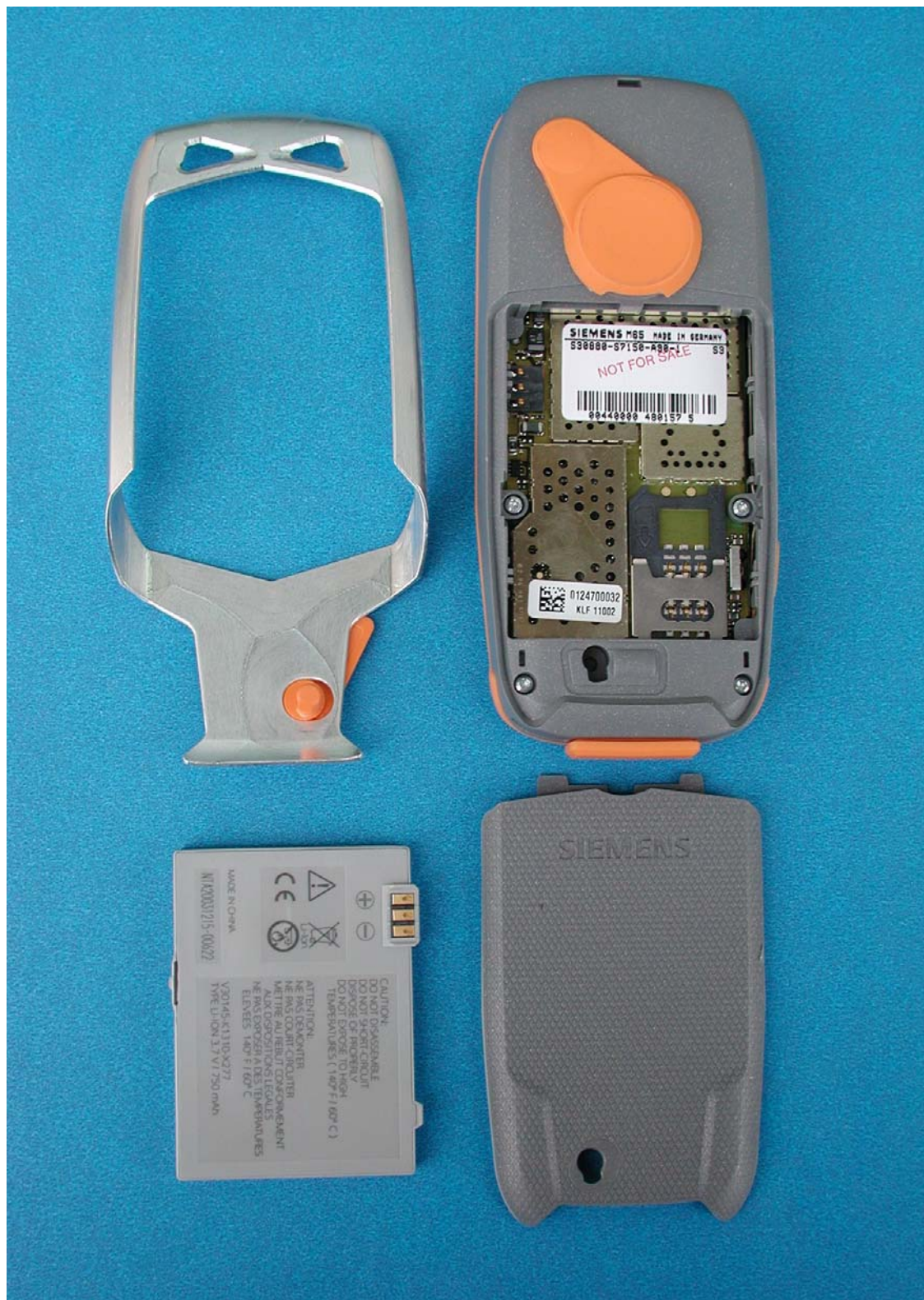
M65 Open battery cover (Final label: see extra exhibit)