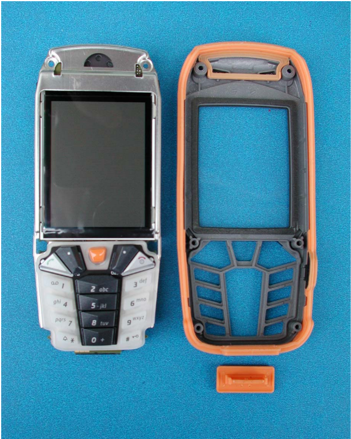
M65 Disassembly step 1