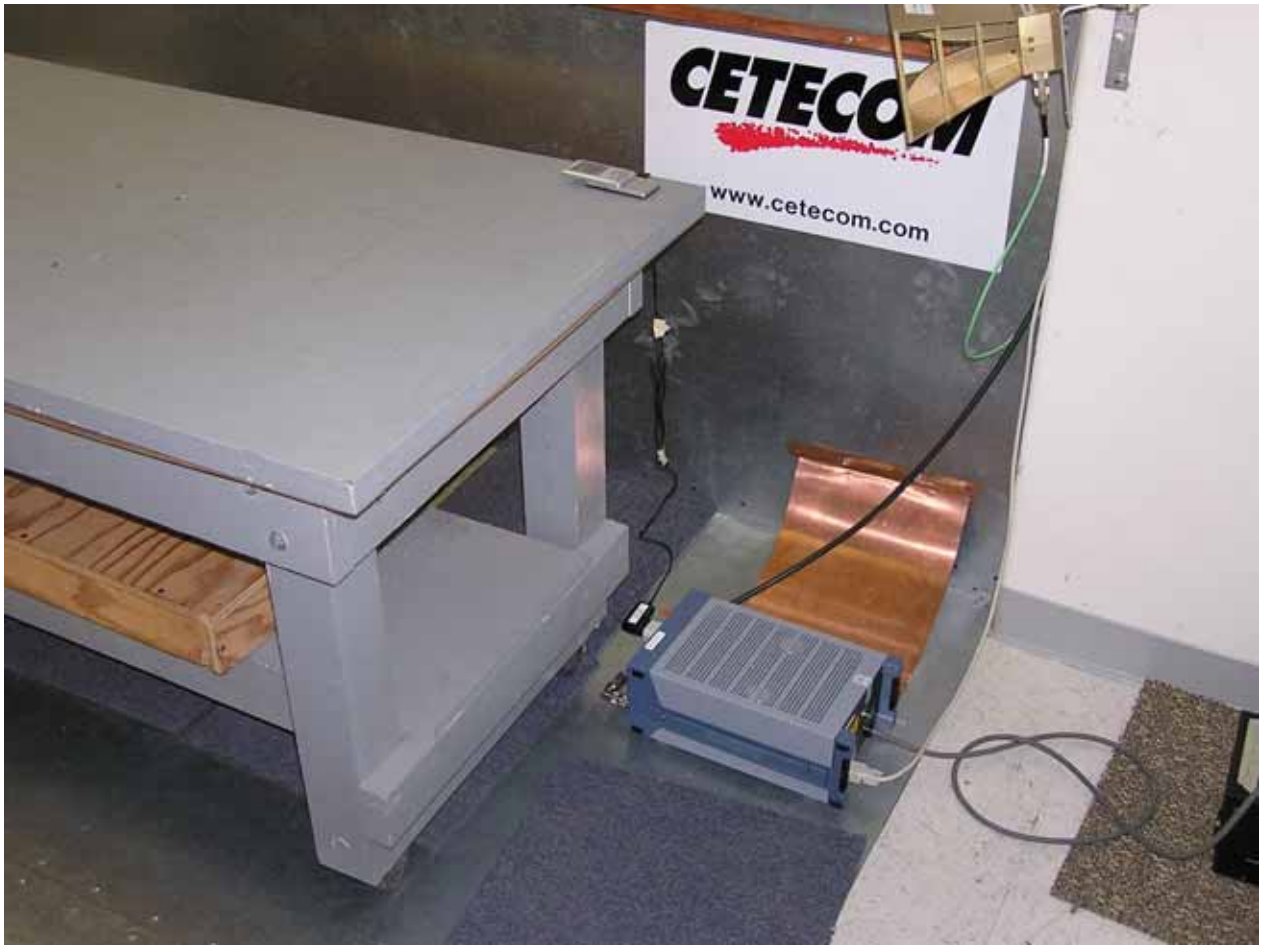
AC LINE CONDUCTION