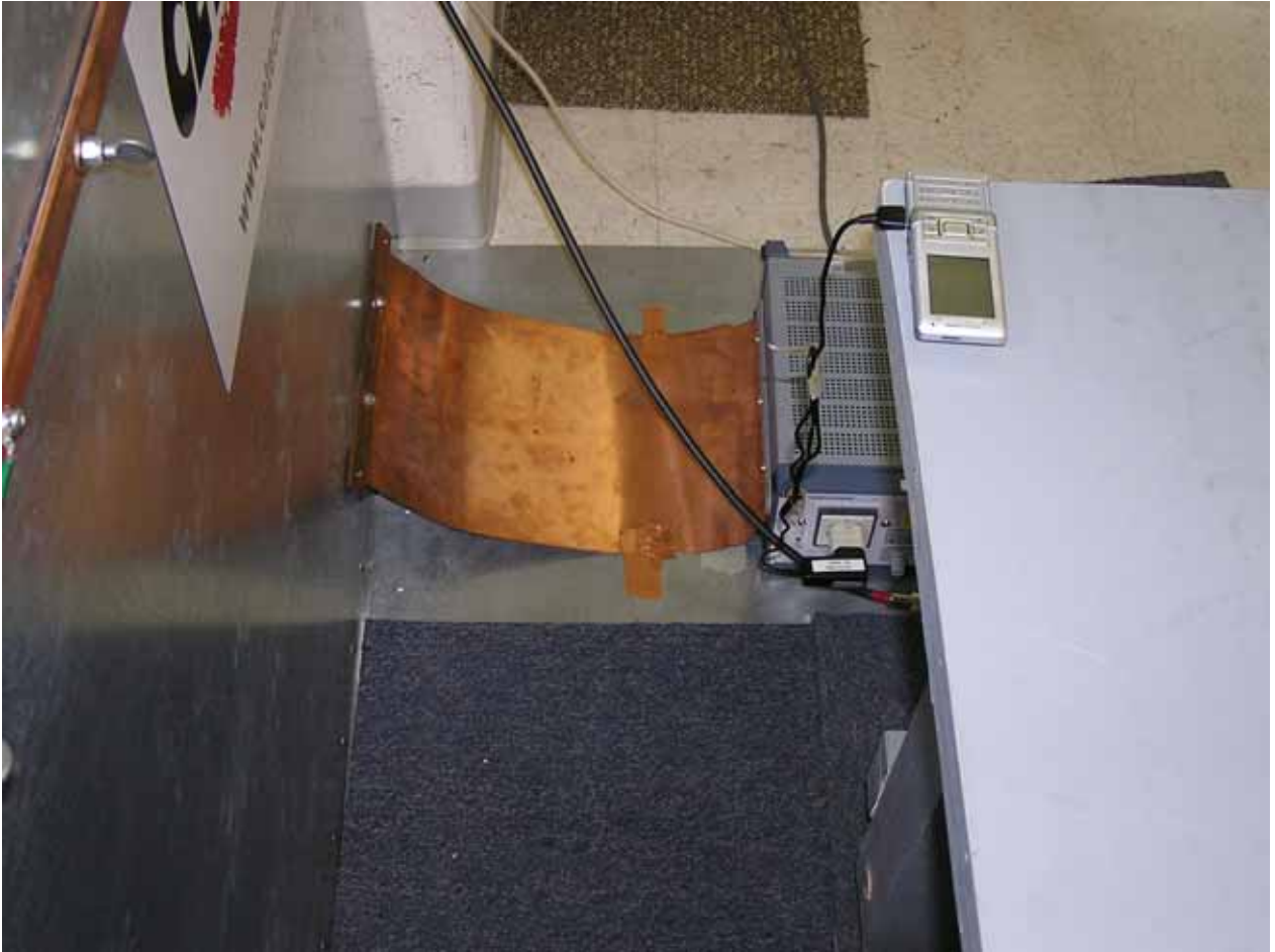
AC LINE CONDUCTION