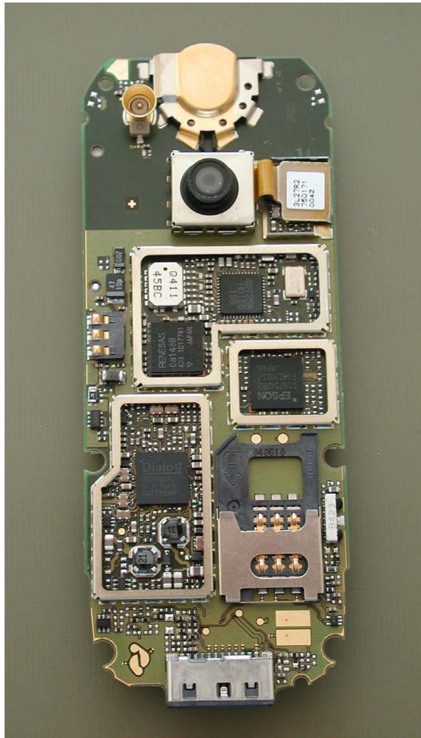
CX70 PCB Back View Shields Removed