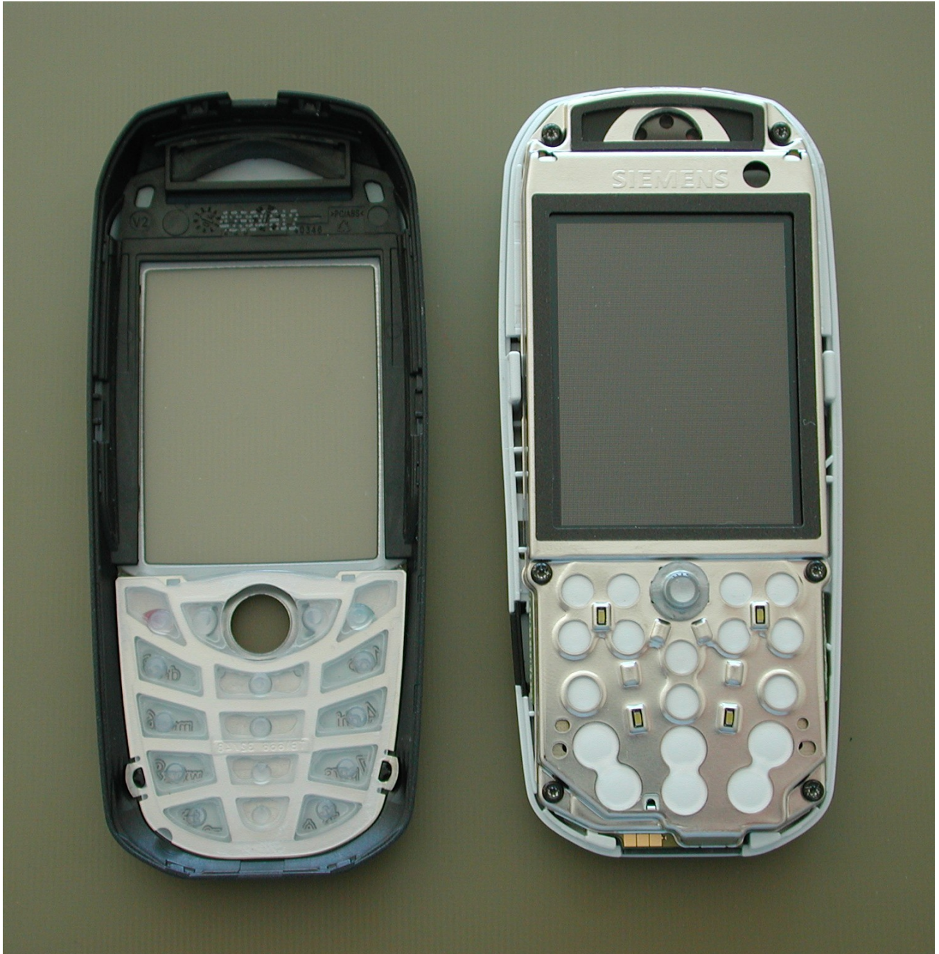
CX70 Disassembly Step 1