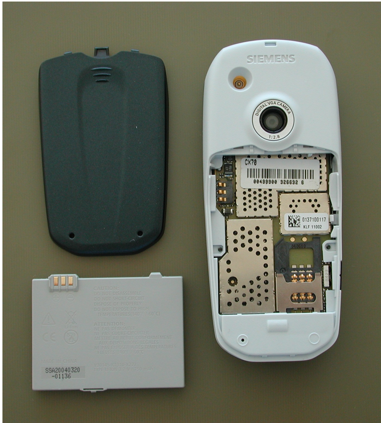
CX70 Open Battery Cover (Final label: See extra exhibit)