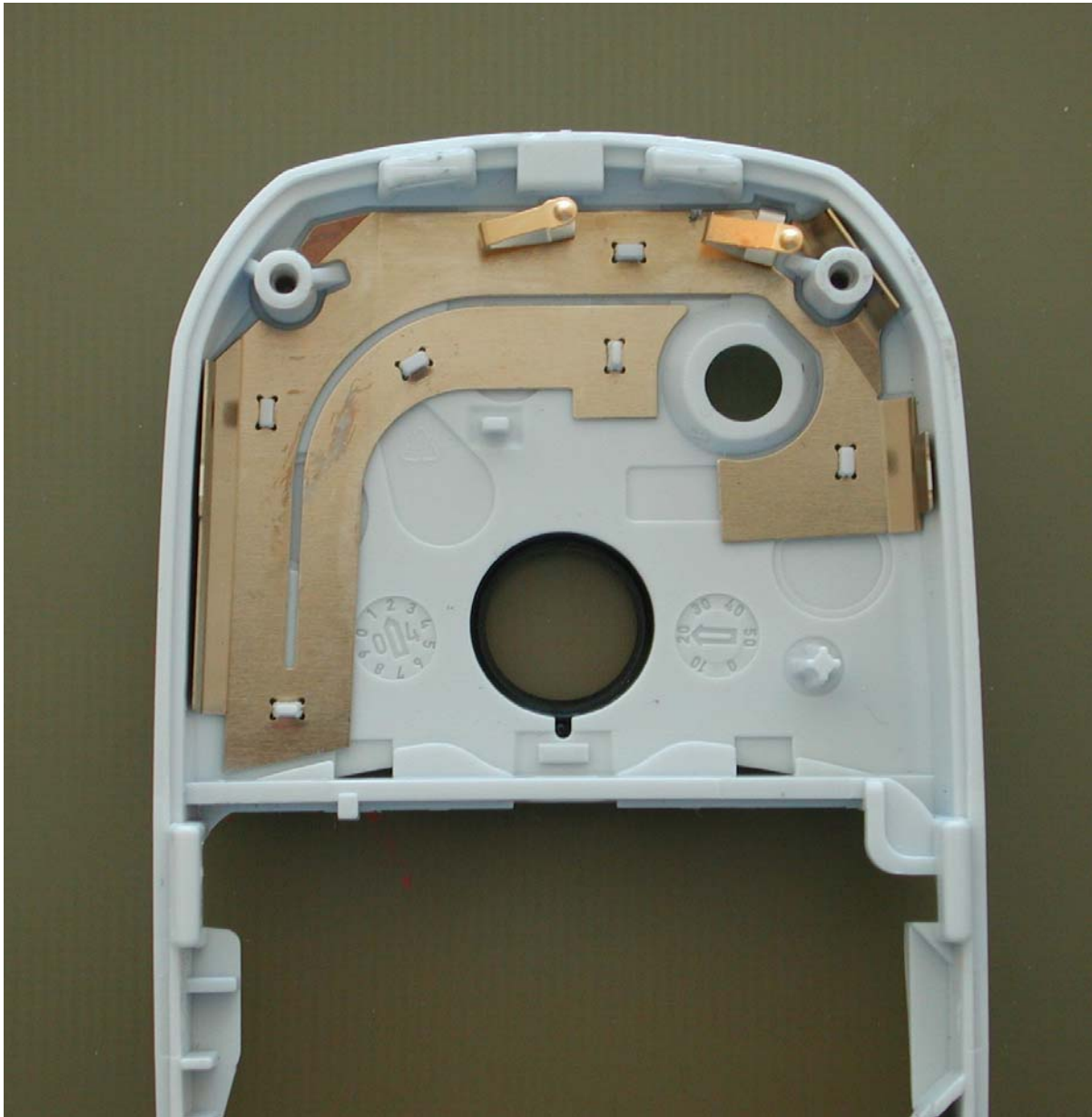
CX70 Tri-Band Antenna