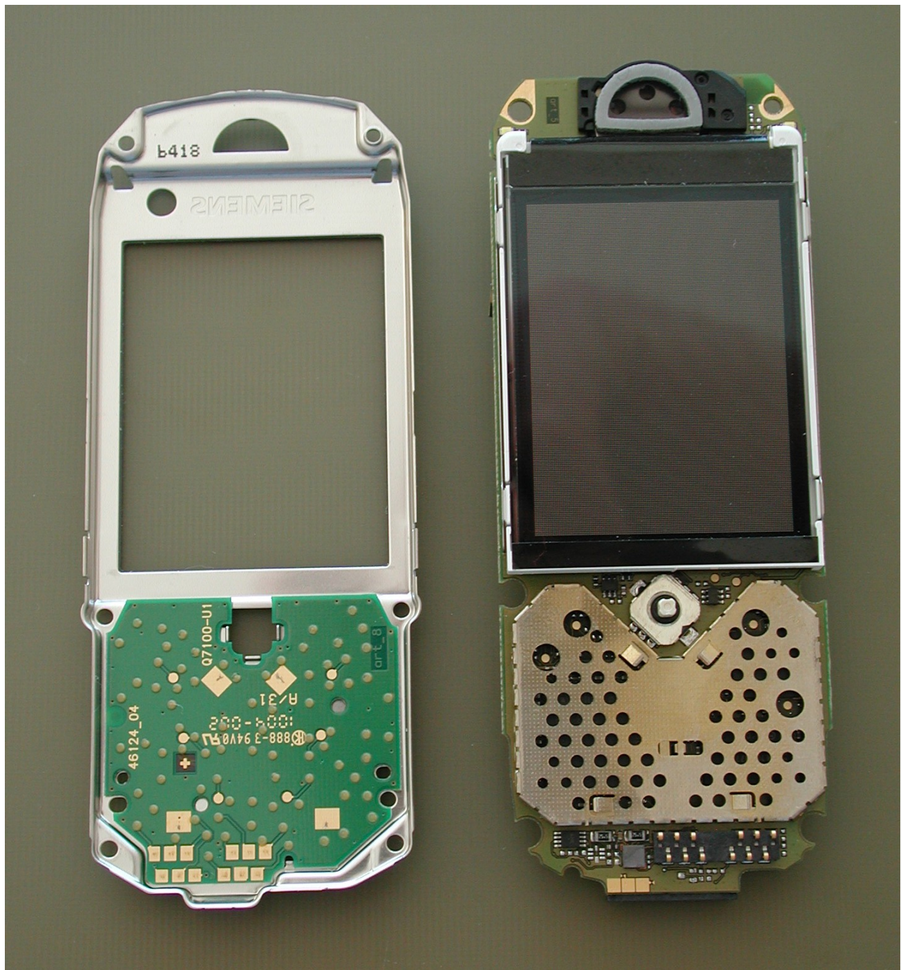
CX70 Disassembly Step 3