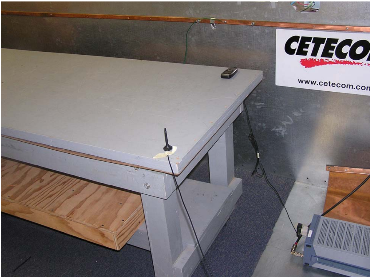
AC LINE CONDUCTION