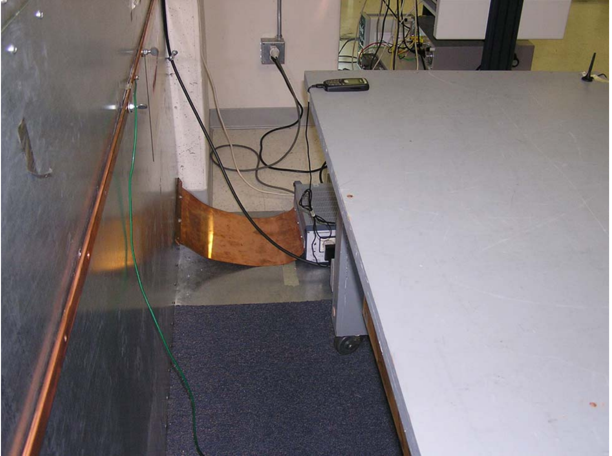
AC LINE CONDUCTION