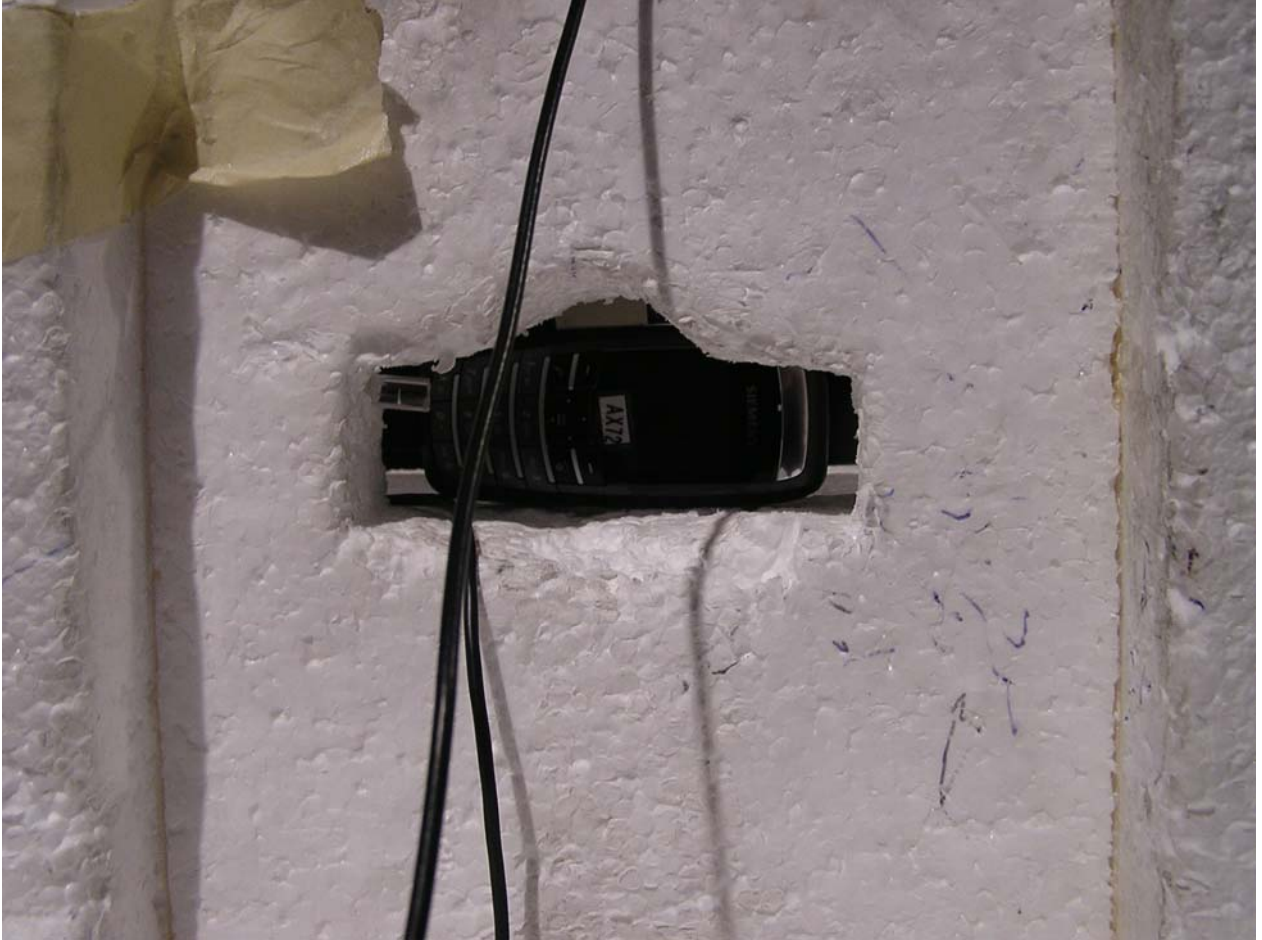
RADIATED EMISSIONS CLOSE-UP