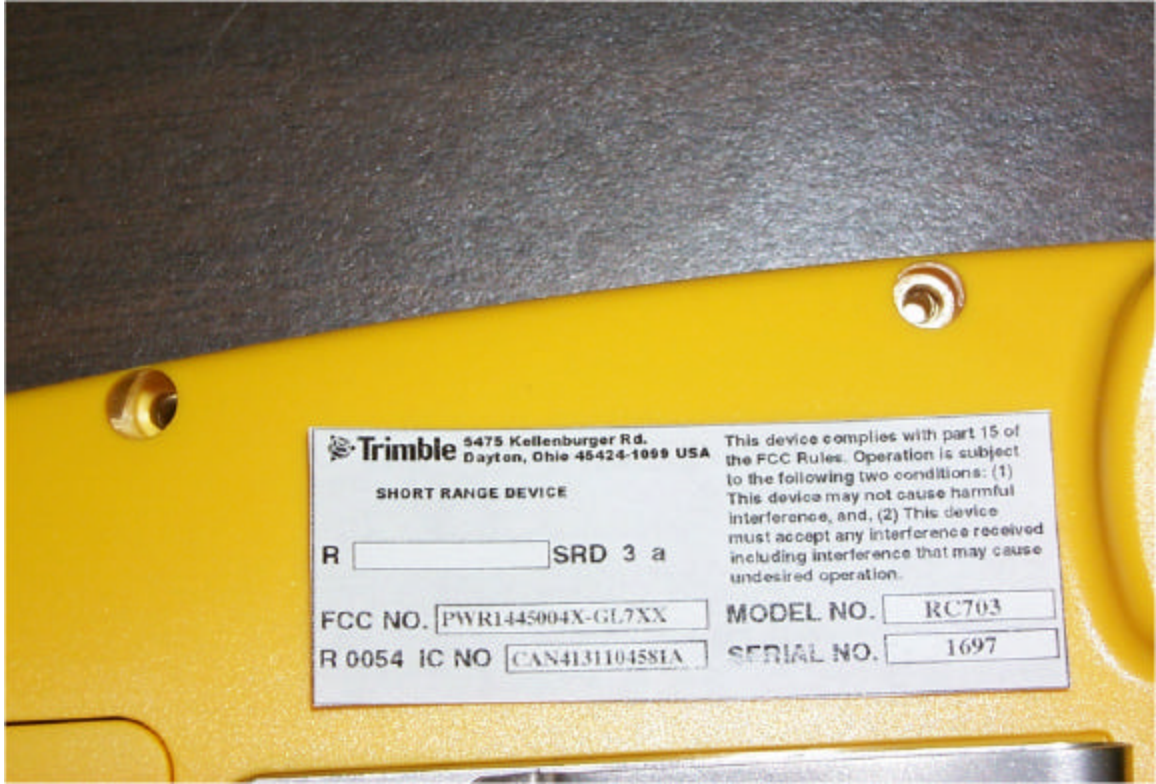
RC703 LABEL CLOSEUP