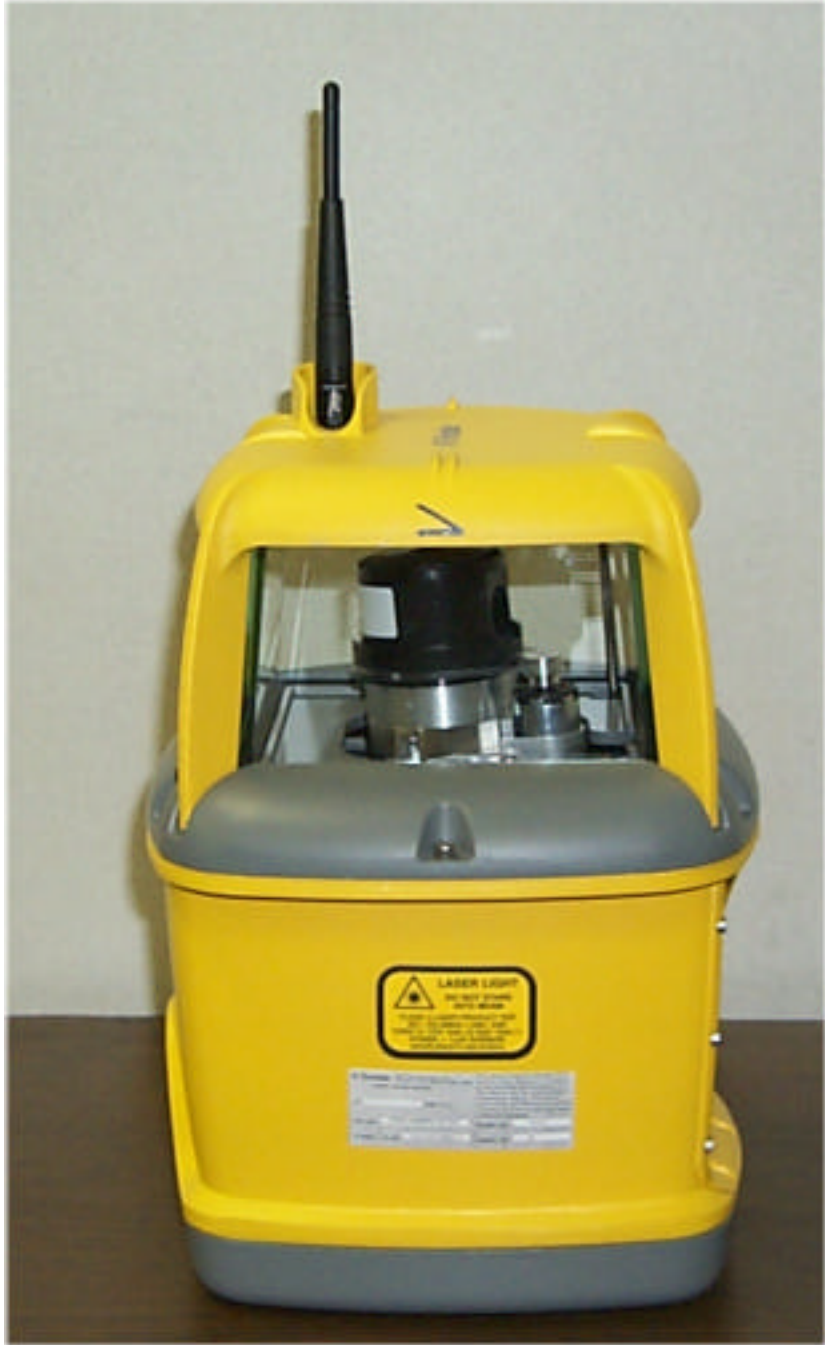
GL722 LABEL SIDE