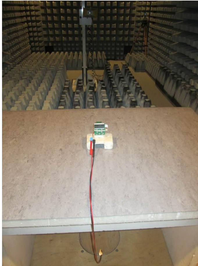
140852_03: Test setup - Radiated emission (fully anechoic chamber)