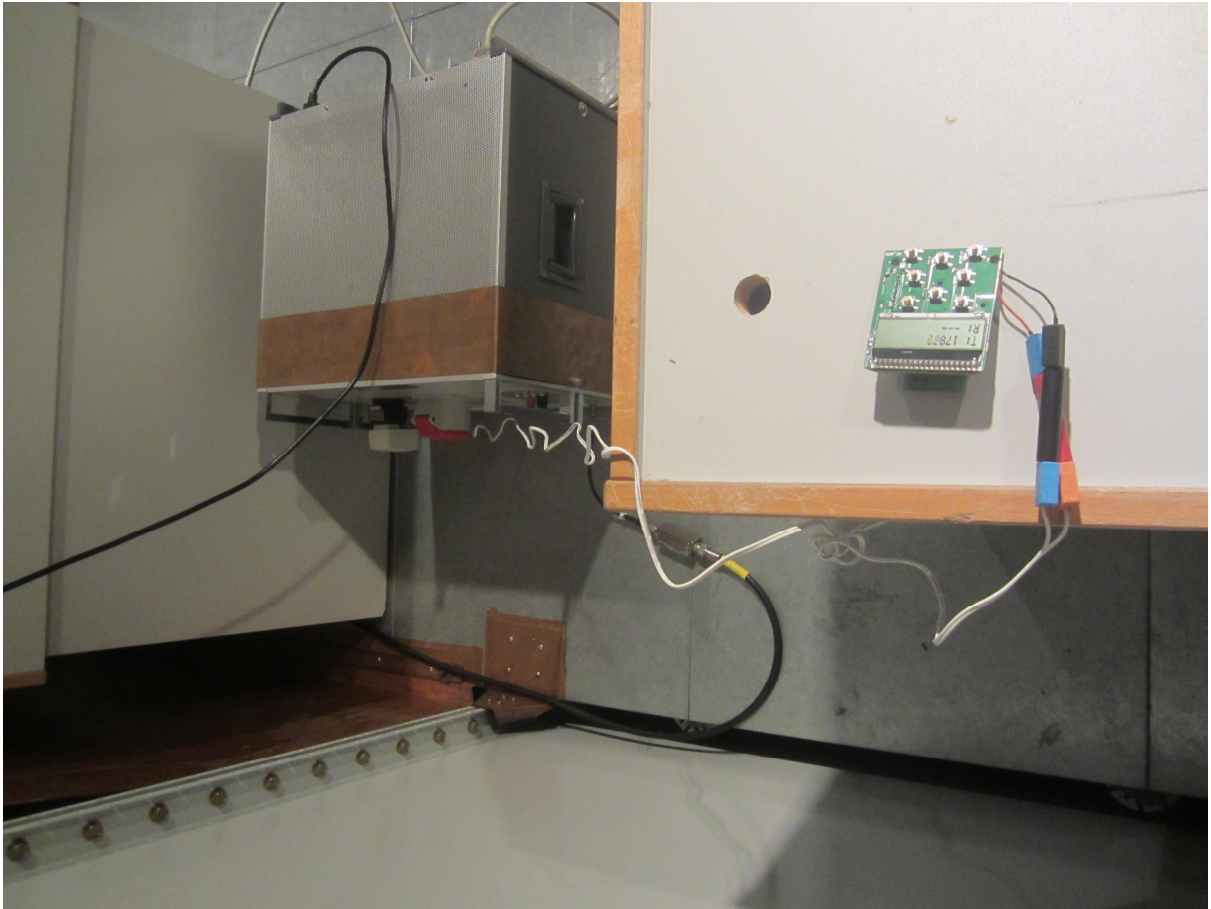
140852_04: Test setup – conducted emissions on power supply lines