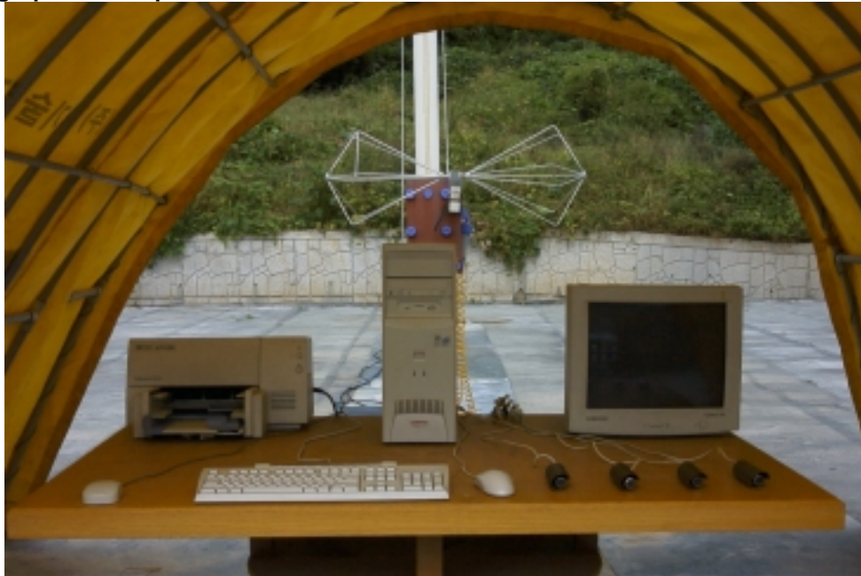
Photograph 1 : Setup for radiated Emissions