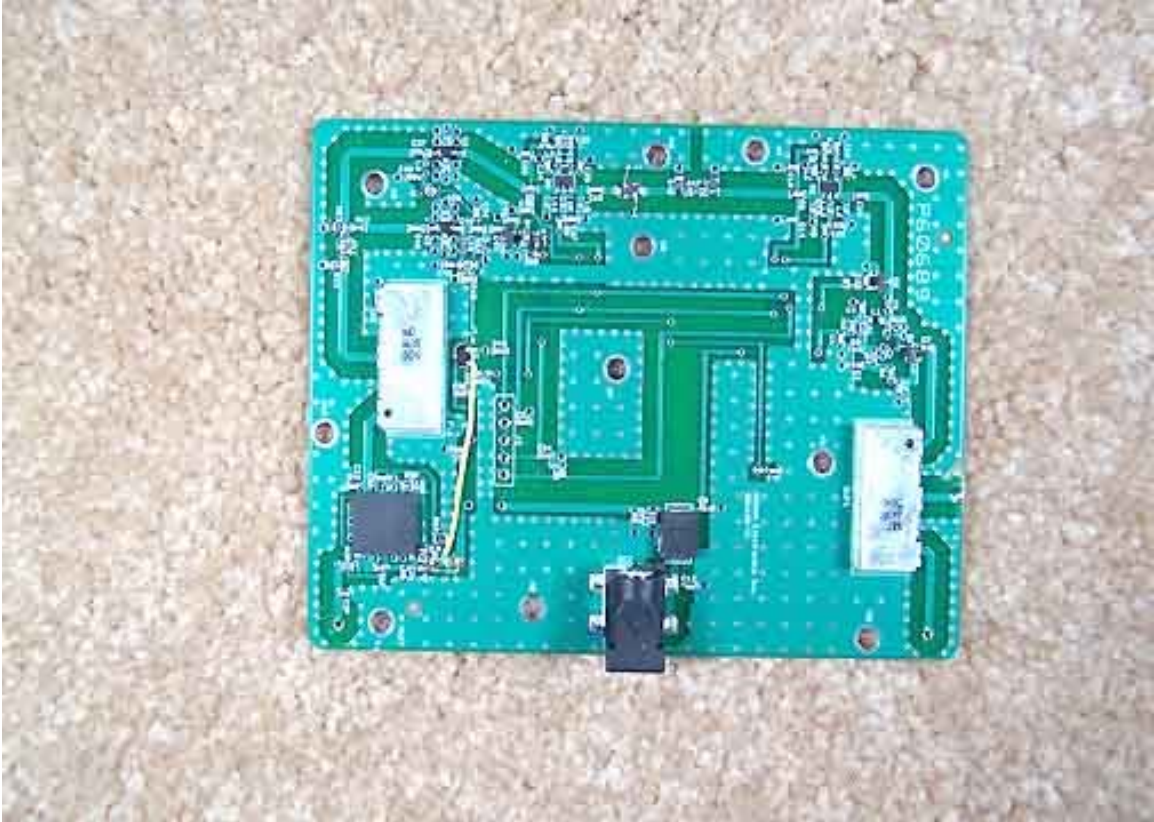
Bottom PCB Top