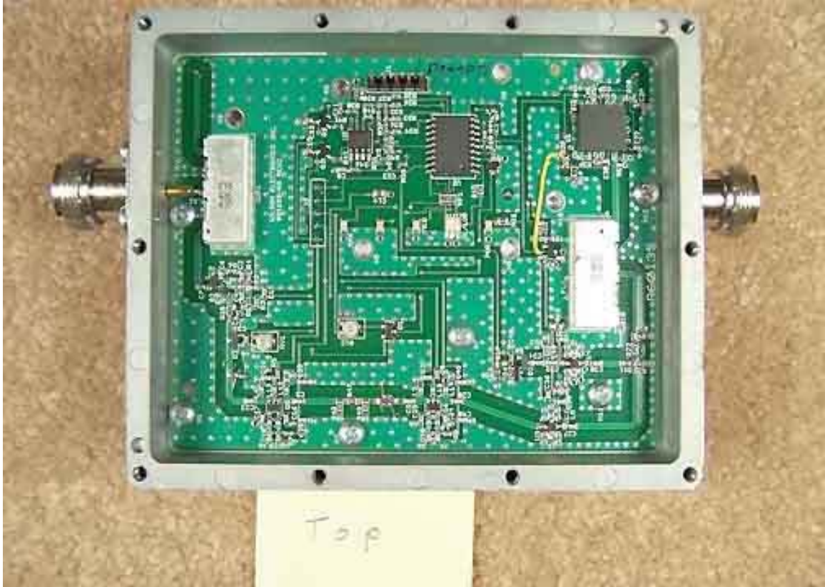
Internal Overall Top