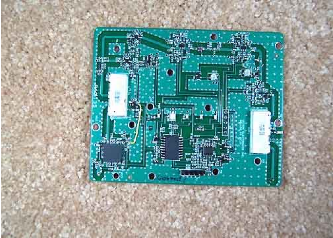
Top PCB Top