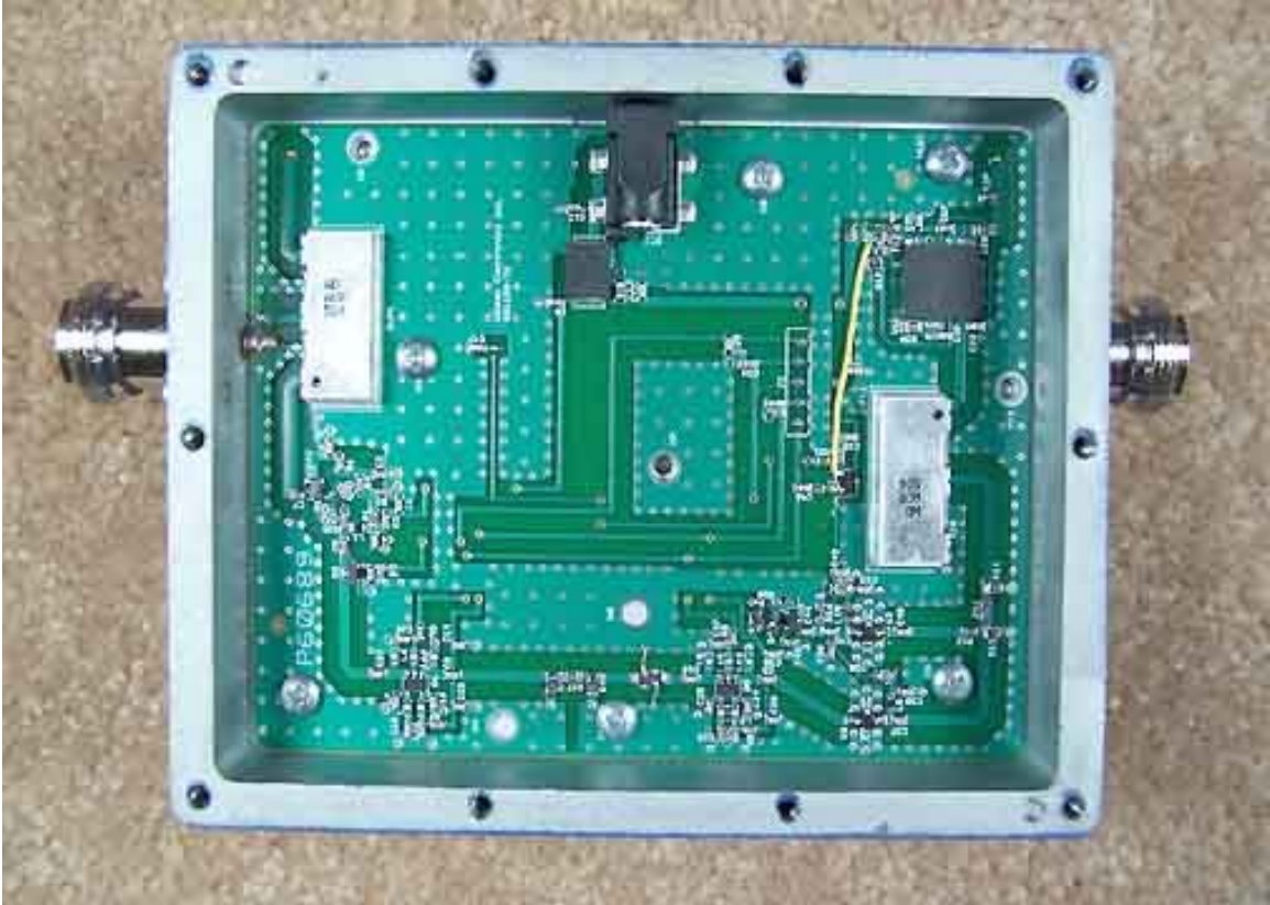
Internal Overall Bottom