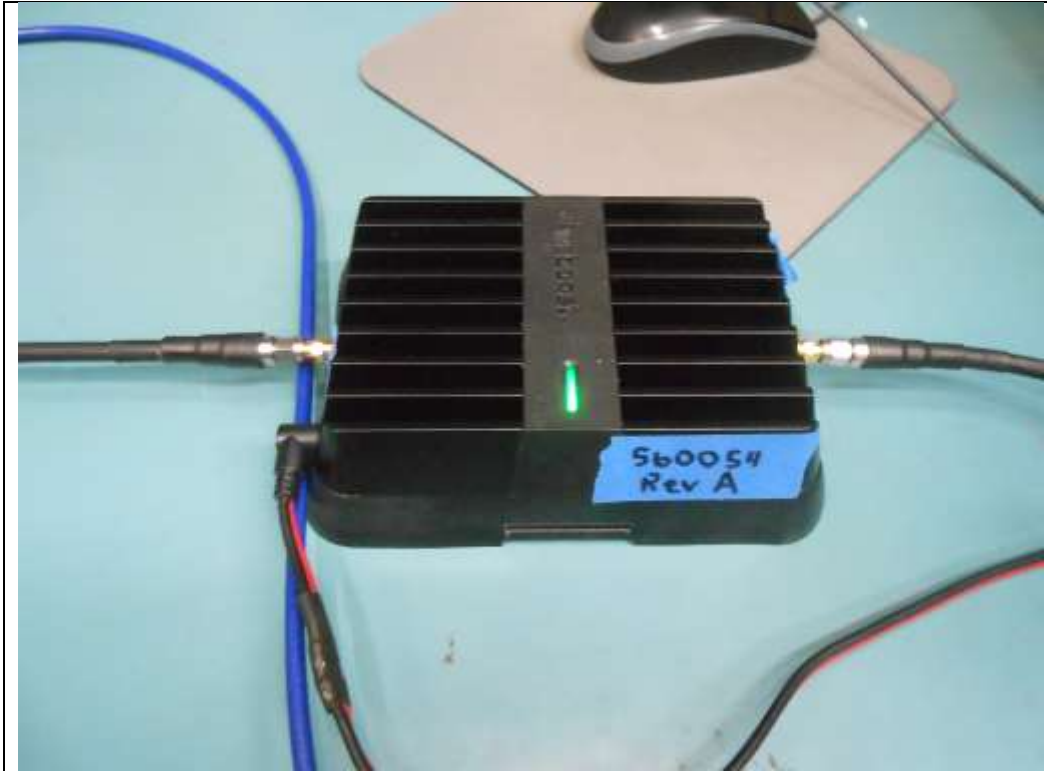
RF Conducted #2