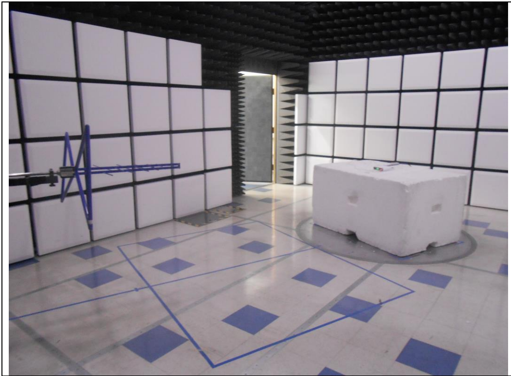
RF Radiated #2