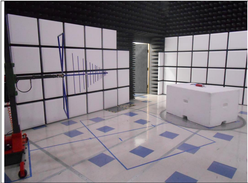
RF Radiated #2