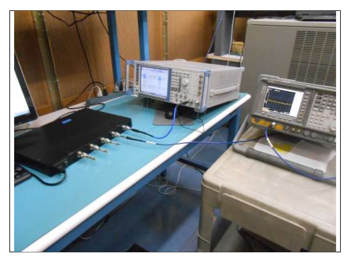
RF Conducted #2