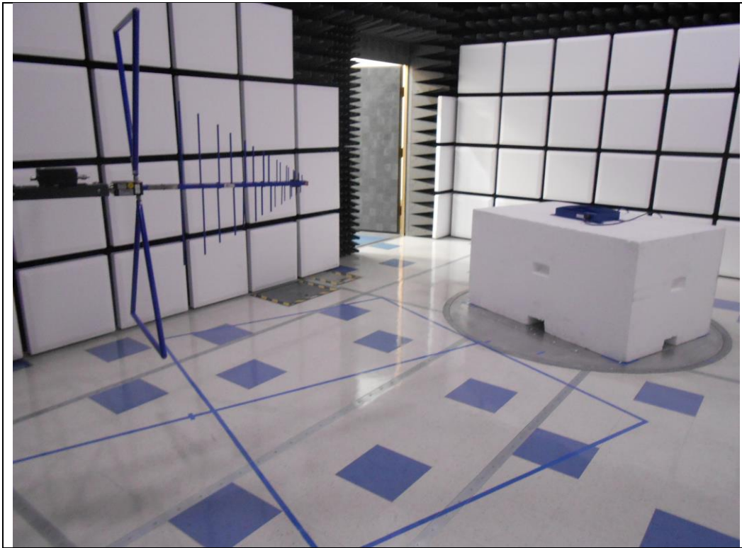
RF Radiated _ above 1 GHz