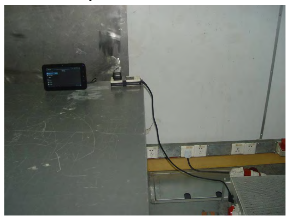
Radiated spurious emission up to 1G(Transmitting Mode):