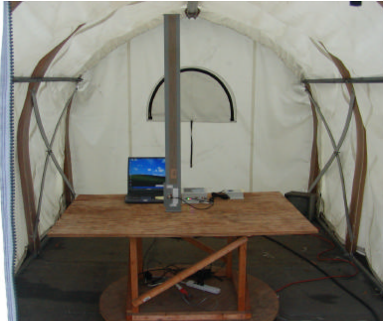
Radiated Emission – EUT with PAWSA24-16 16.5dBi Horizontally Polarized 90 Degree Sector Antenna Rear View