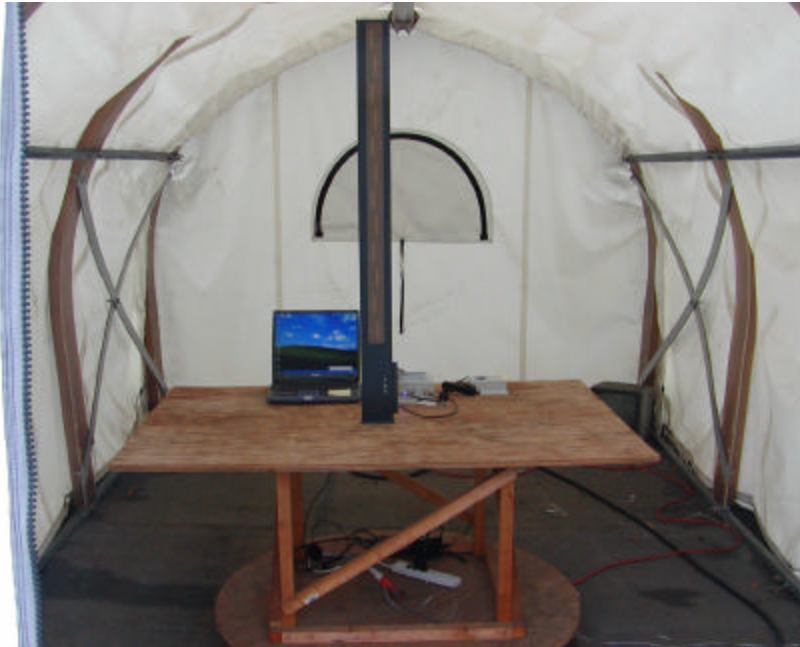
Radiated Emission – EUT with PAWODH24-13 13dBi Horizontally Polarized Sector Antenna Rear View