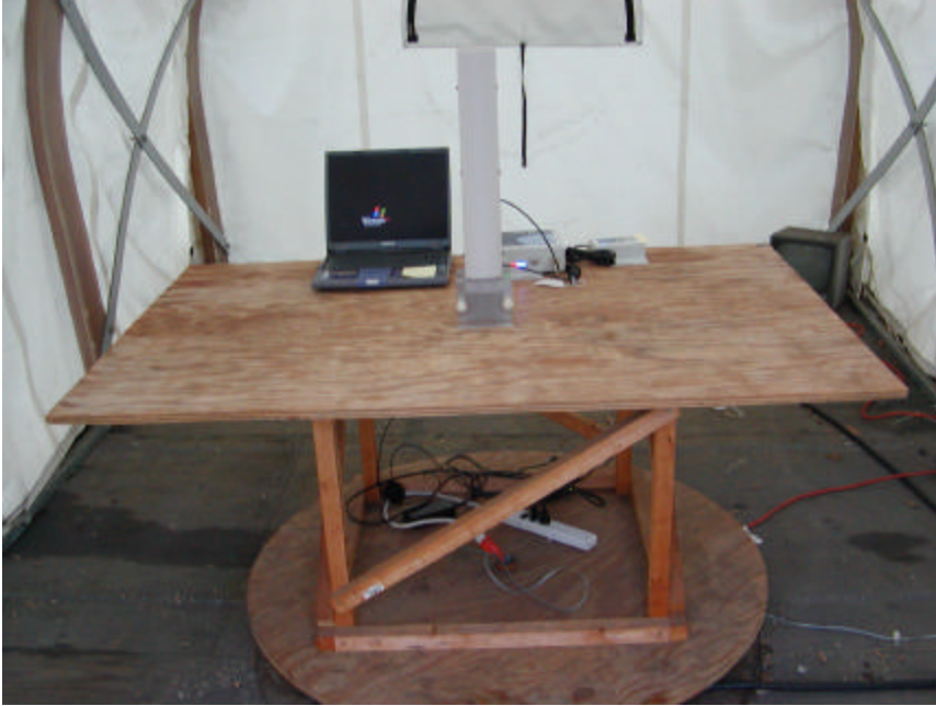
Radiated Emission – EUT with WISP 24013-90PTNF 14dBi 90 Degree, Sector Panel Antenna Rear View