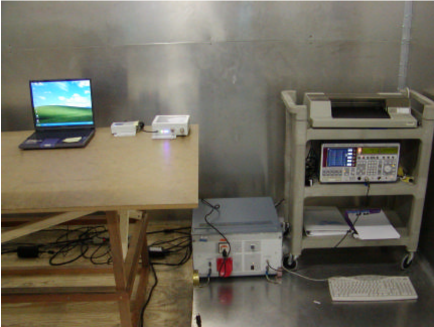
Conducted Emission - Side View