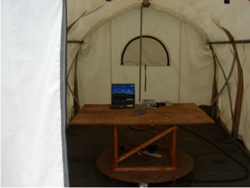
Radiated Emission – EUT with PAWOD24-12 12dBi Omni Directional Antenna Rear View